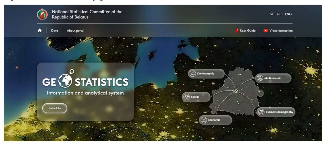
Figure 2 Interface of the main page of IAS "Geostatistics"

29. The system is available anywhere in the world in Belarusian, Russian and English, including from mobile devices. IAS Geostatistics is constantly updated with new data. We try to make the maps interesting and accessible for analyses, deepen the dynamic series. You can familiarise yourself with the system's capabilities at https://gis.belstat.gov.by/.