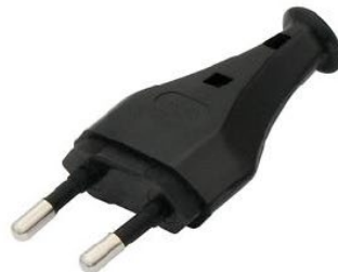
Type C: This will fit