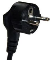
Type F: This will NOT fit