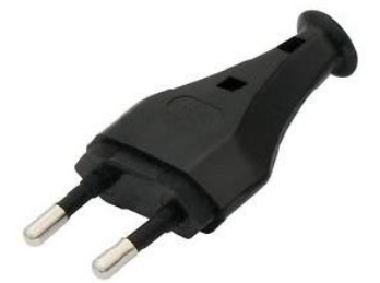
Type C: This will fit