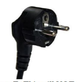
Type F: This will NOT fit