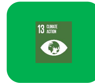
World Data Forum

Review and Revise CTGAP Plan for the next WDF