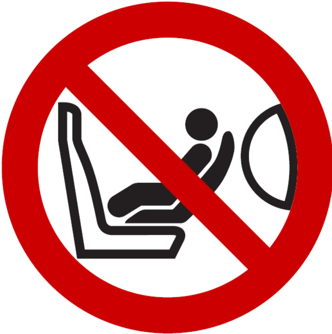
Figure B Pictogram according to ISO 2575:2004 - Z.01 that shall be used and that shall have an outer diameter of at least 38 mm