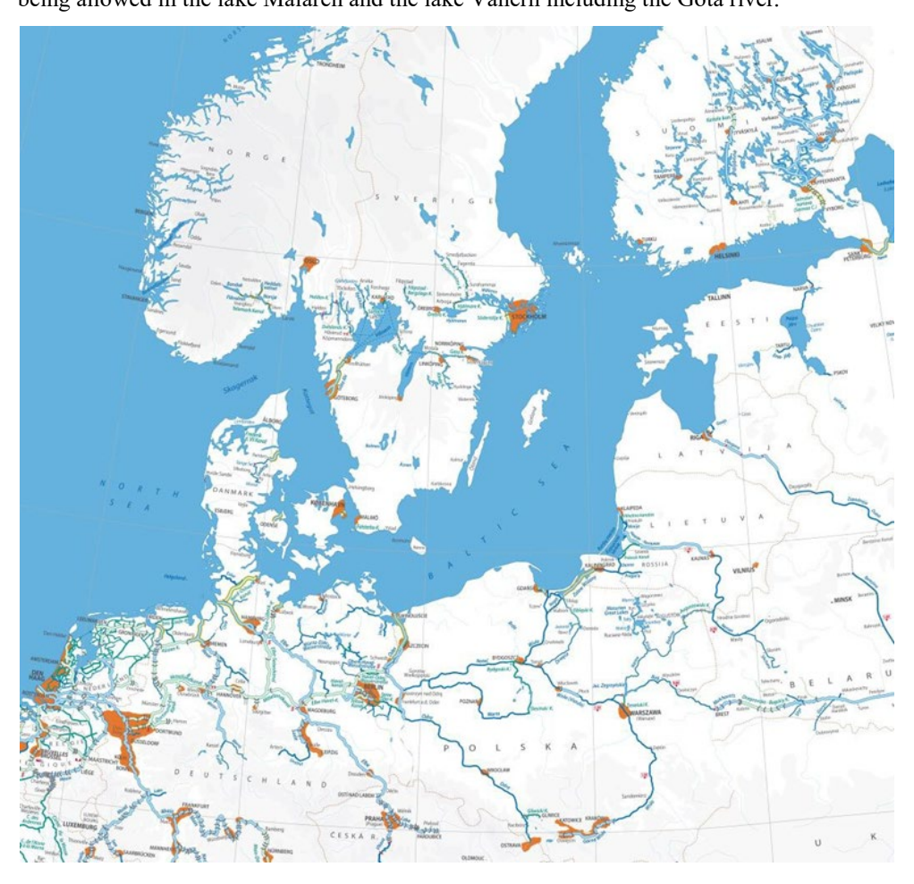
Figure 2 Important economic areas connected to inland waterways Remark for Sweden: inland navigation is time being allowed in the lake Mälaren and the lake Vänern including the Göta river.

Using inland navigation and river-sea shipping is a way to shift transport of goods from road to waterways in future. The navigable inland waterway network within the European Union exceeds 40 000 km<sup>5</sup> and covers all important economic areas in Central Europe. Many industrial and population centres are located along inland waterways. Half of Europe's population lives close to the coast or to inland waterways and most European industrial centres can be reached by inland navigation and river-sea shipping.