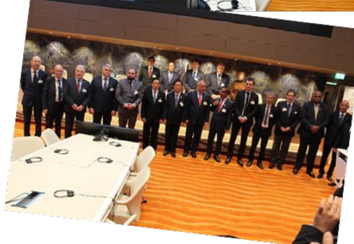
Cutting-edge side events and demos