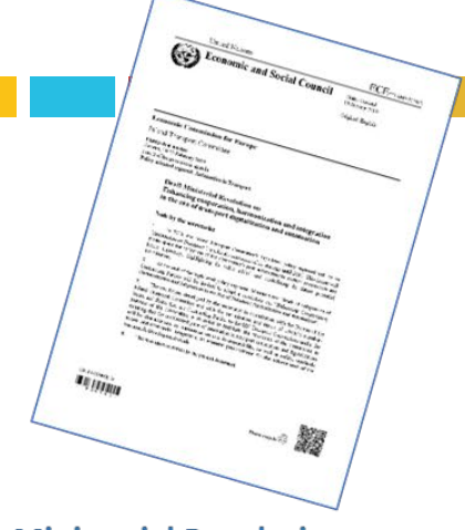
Ministerial Resolution on transport automation and digitalization