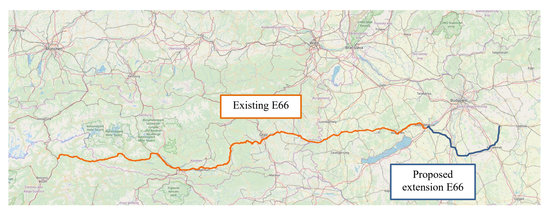
E66 – Proposed extension I. (The whole E66 route)