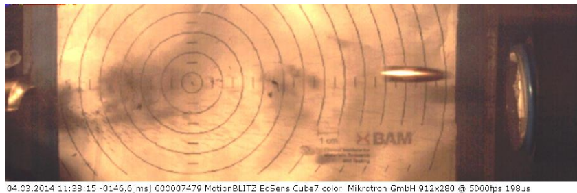
Fig. 2: Projectile at the end of the scale at t = 3.2 ms

Table 1 shows the energies of the projectiles of various cartridges determined by BAM