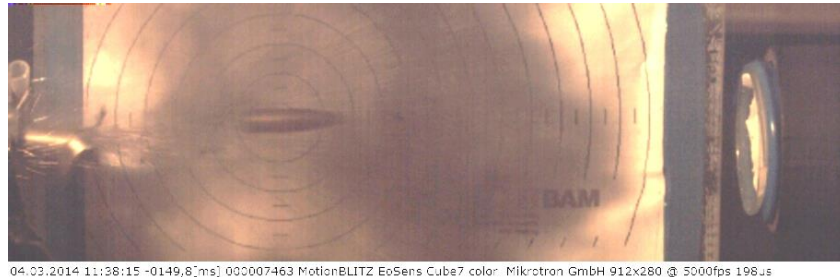
Fig. 1: Projectile after firing without barrel at t = 0

Within the framework of the tests, individual cartridges were actuated with the BAM actuator (see INF.27 43 rd session) and recorded in front of a scale with a high-speed camera with either 10,000 fps or 5,000 fps. By evaluating the single frames, the velocity can be easily determined.