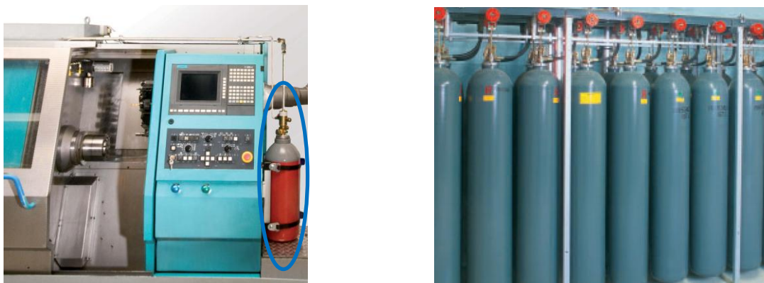
Figures 4 and 5: Gas cylinders used in stationary fire-fighting installations