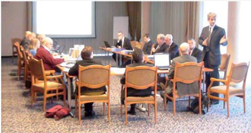
TAG meeting in Lithuania (2011)

TAG members (the number is not exactly specified)