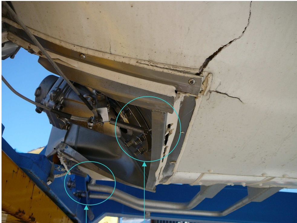
Damaged Valve stem