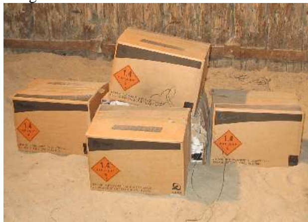
Fig. 4 Result of confined test