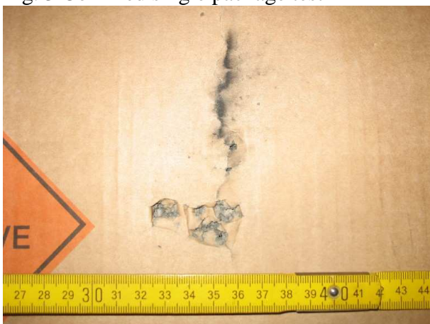
Fig. 5 Fibreboard wall outside