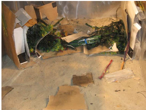
Fig. 2 Result of unconfined test