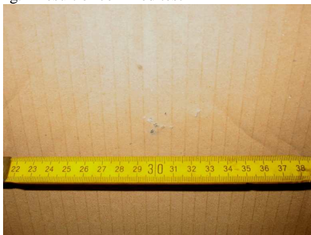
Fig. 6 Fibreboard wall inside