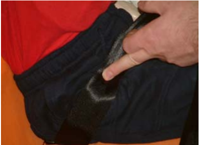
Figure 4: P3 without Booster CRS. Pelvic load bearing point is 122mm above Cr.

The height of the pelvic load bearing point measured for the Hybrid II and the P10 was 191 mm and 157 mm respectively. The same measurement was carried out with P3 and P6 dummies. The corresponding height of the load bearing point of these dummies was 147 mm and 121 mm respectively for P6 and P3. This indicates for instance that the pelvic position of a 3 year old child with regards to the adult belt can be considered to be 70 mm lower than that of a 50<sup>th</sup> percentile adult (Figure 4).