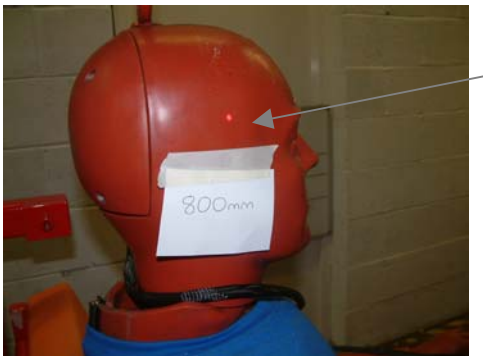
Laser point indicating the 800 mm height