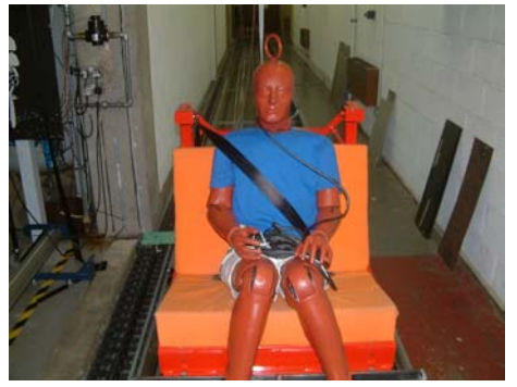
Installation of the Hybrid II dummy on the R44 sled test bench.

A physical study using test manikins on the ECE R44-03 defined test bench was then conducted to compare the relative head positions of the Hybrid II 50<sup>th</sup> percentile and the P10 dummies with respect to the 800 mm plane. This plane was materialized using a laser pointer as shown in Figure 2.