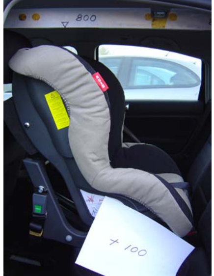
CRS position B The CRS is positioned 100mm forward from the vehicle seat back. The resulting distance between the top of the CRS and the 800mm limit is 55mm.

Figure 1: Positions of a Group 1,2 rear facing child seat with respect to 800 mm horizontal plane.