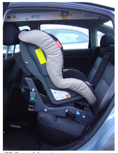
CRS position A The CRS is positioned in full contact with the vehicle seat back. The resulting distance between the top of the CRS and the 800mm limit is 80mm.