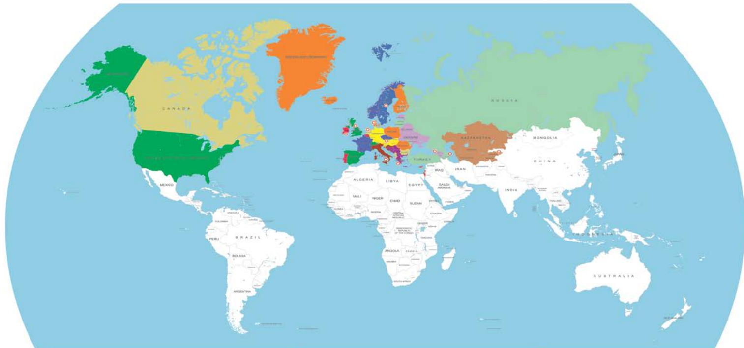
United Nations Economic Commission for Europe