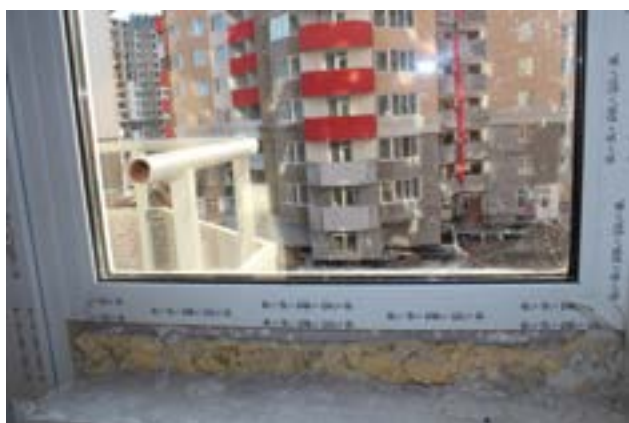
Picture 4. Energy efficiency in housing construction