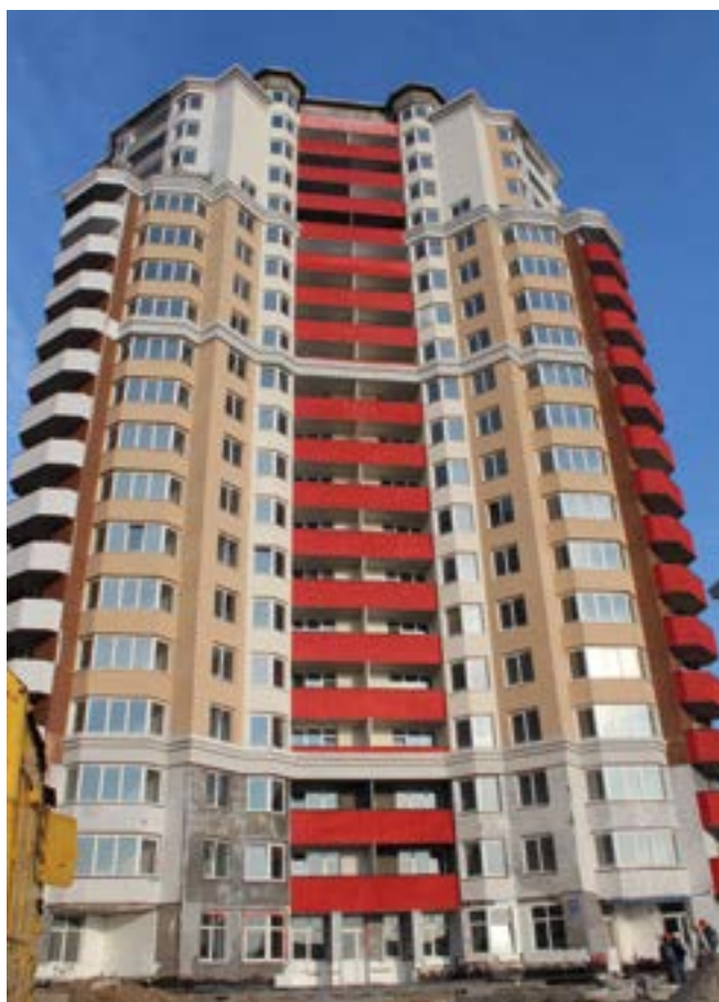
Picture 5. A social housing under construction

The current level of tariff collections is quite high at 90-98% depending on the region. The national average for 2010 is 96.6%. At the same time, accumulated debts from previous periods constitute a serious problem as they amount to UAH 11.4 billion, equivalent to four months of tariff collections.