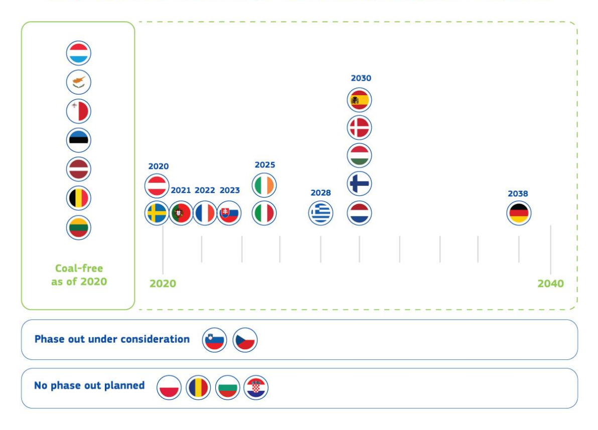
Update on transition-related issues in the EU Coal phase out commitments as per National Energy and Climate Plans (NECPs)

Overall, the NECPs did not provide a clear prioritisation of funding needs regarding just transition, nor investment needs for reskilling and upskilling and for support of labour market adjustments. A description of how the different sources of funding will complement each other are needed to promote a just and fair transition.