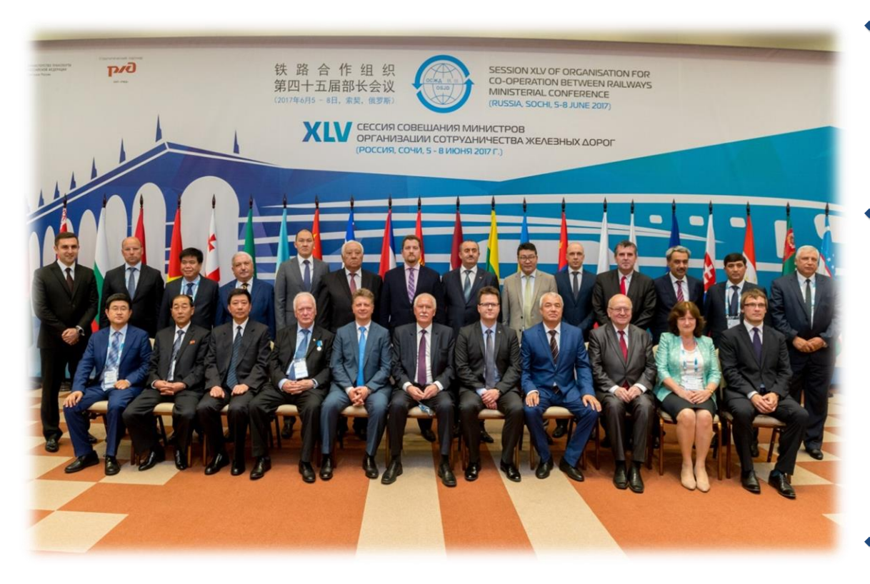
The XLV OSJD Ministerial Conference session (Russia, Sochi, 5-8 June 2017)

Convention on International Through Railway Traffic;