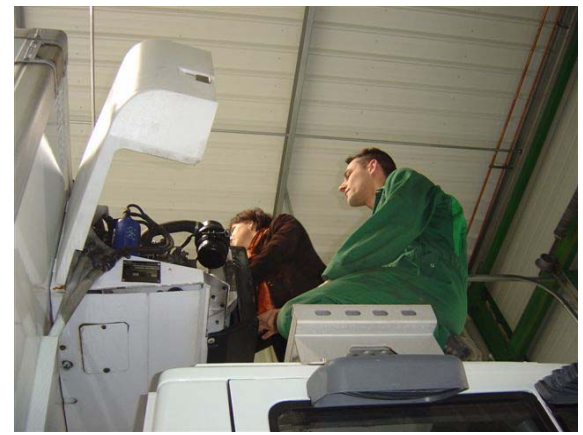
Verification of equipment by experts