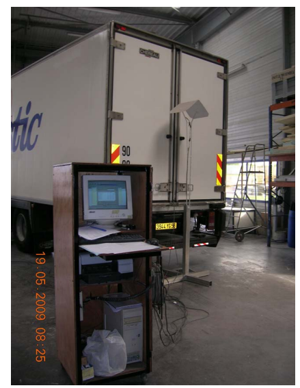
Equipment being tested for efficiency in a test centre

9. The competent authority in France, in cooperation with Transfrigoroute France and Cemafroid, the official ATP testing station, worked on new protocols for the more than 10,000 tests conducted each year, of which 5,000 concern dependent equipment. The objective was to develop a robust, simple and cost-effective test.