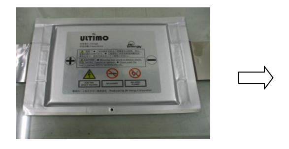
Fig. 2(1) Before test