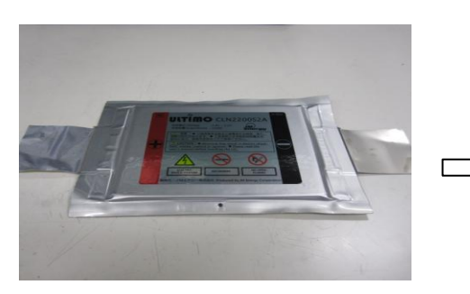
Fig. 1(1) Before test