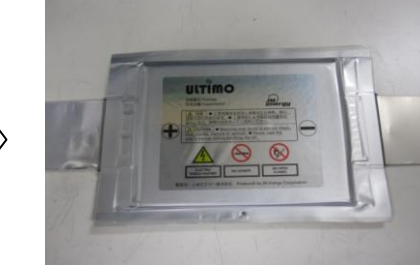
Fig. 2(2) After test