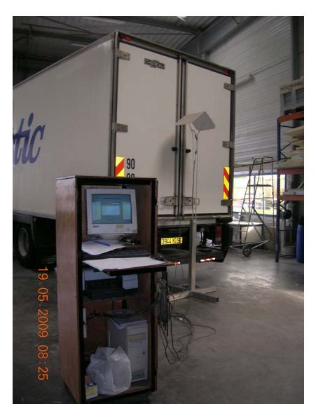
Equipment being tested for efficiency in a test centre