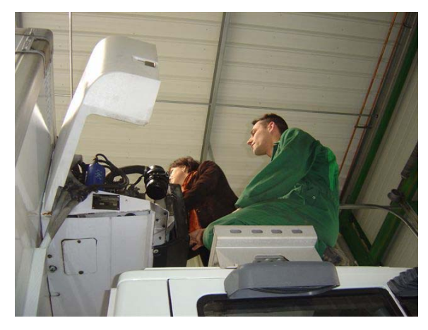
Verification of equipment by experts