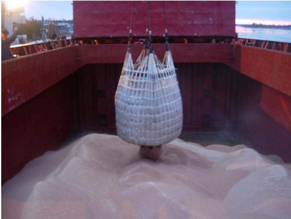
Picture 36 : FBC unloading from the zero elevation into a vessel hold without dust generation