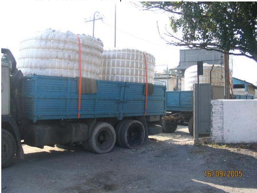
Picture 19 : Secured FBC transportation in a car body and in a trailer2