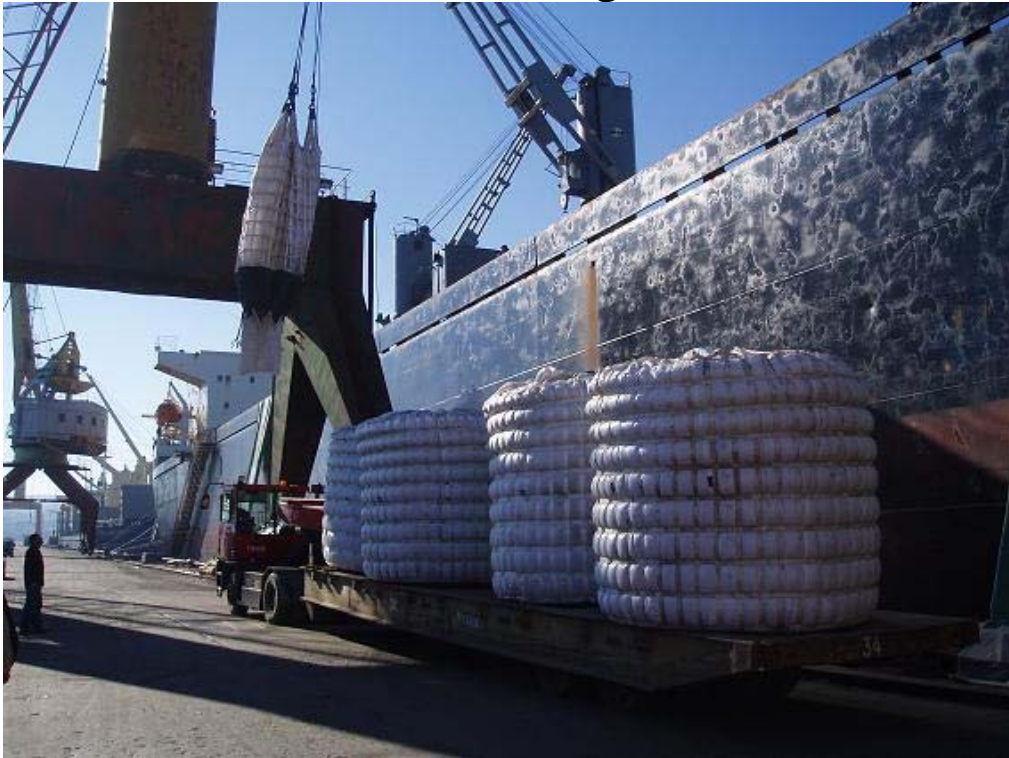
Picture 32 : Empty FBC at 4-sling crane load carrier after unloading