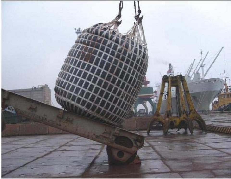
Picture 14 : Determination of the critical angle of FBC filled with highly fluid alum earth