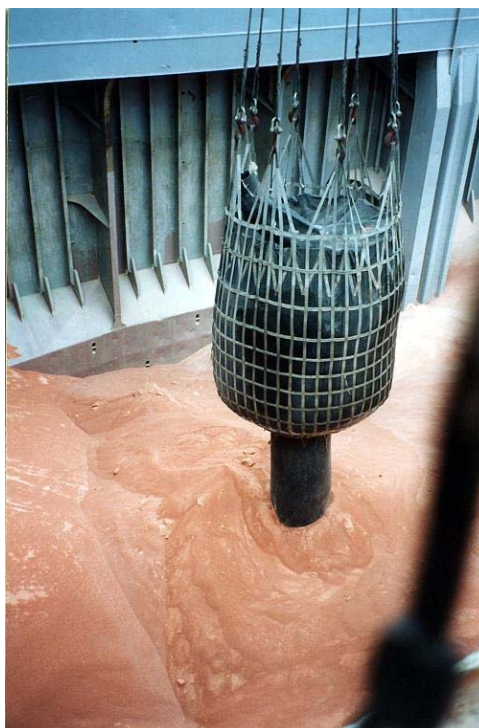
Picture 44 : KCL unloading from FBC from the zero elevation into a vessel hold