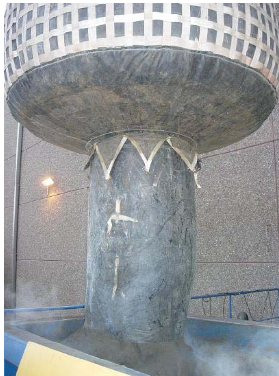
Picture 35 : FBC unloading from the zero elevation into a batcher with no dust generation