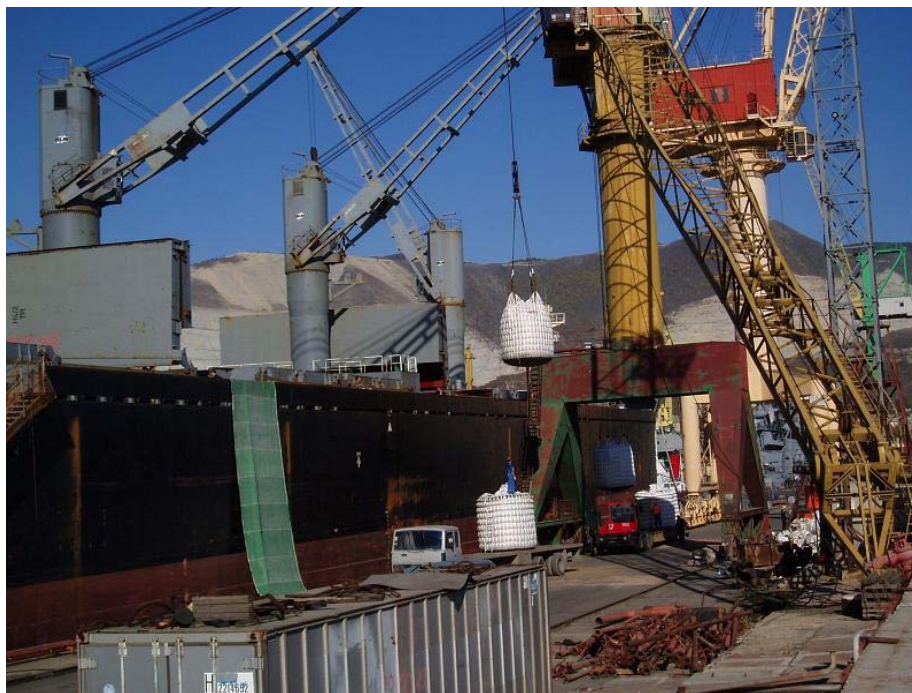
Picture 21 : Unsecured FBC transportation at an automobile platform 4