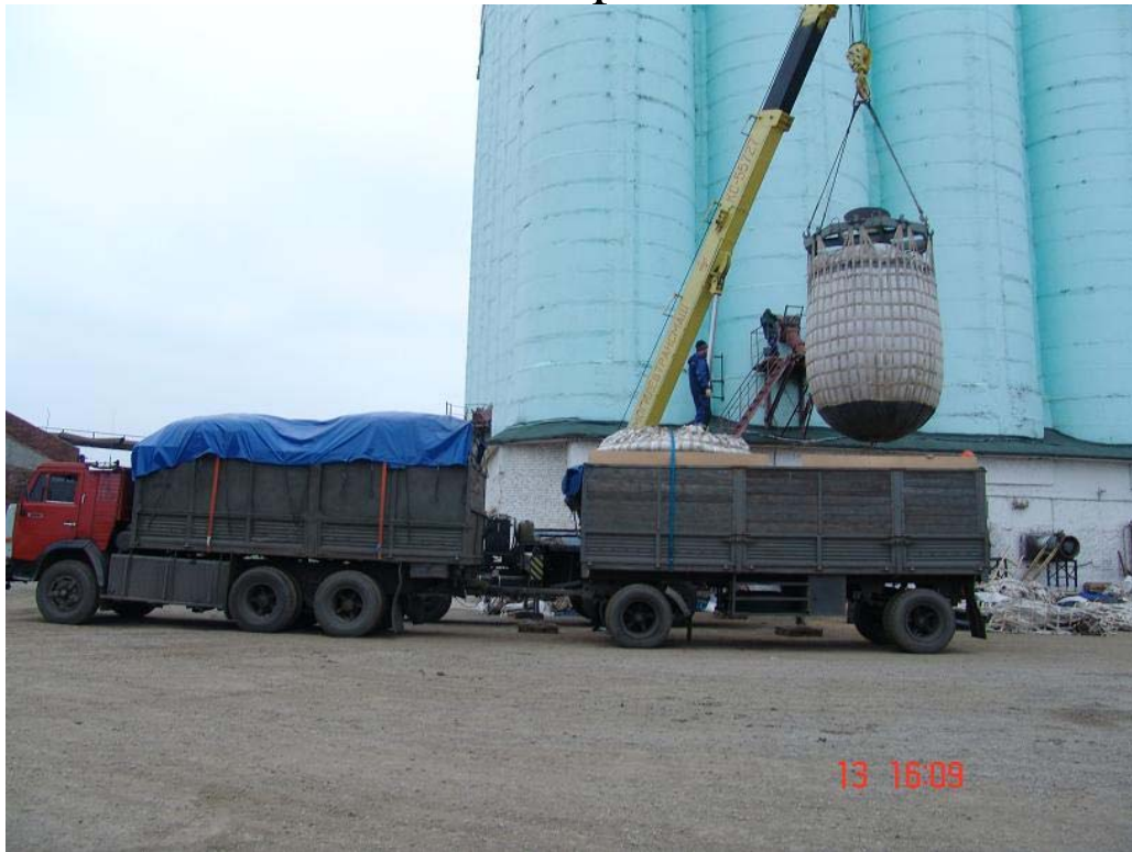
Picture 18 : Secured FBC transportation in a car body and in a trailer1