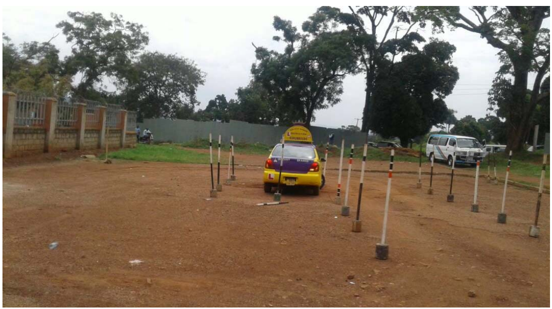
(Photo of a learner after successfully parking the vehicle in the Box)

Mr. Kugonza detailed the process of acquiring a driving permit and noted challenges such as lack of adequate testing institutions and testing materials, limited workforce, failure to roll out the curriculum for driving schools and the inconsistencies in the process.