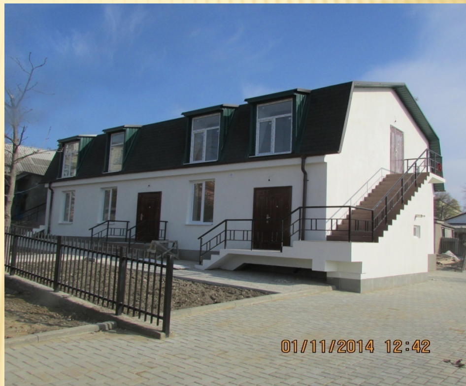
Hîncești, casa de locuit cu 4 apartamente