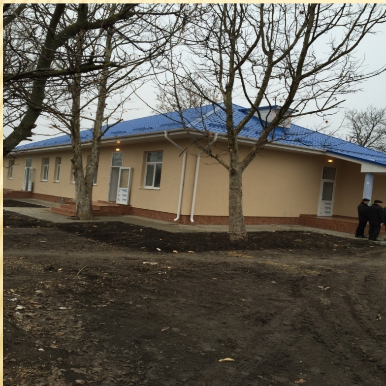
Mingir, casa de locuit cu 4 apartamente