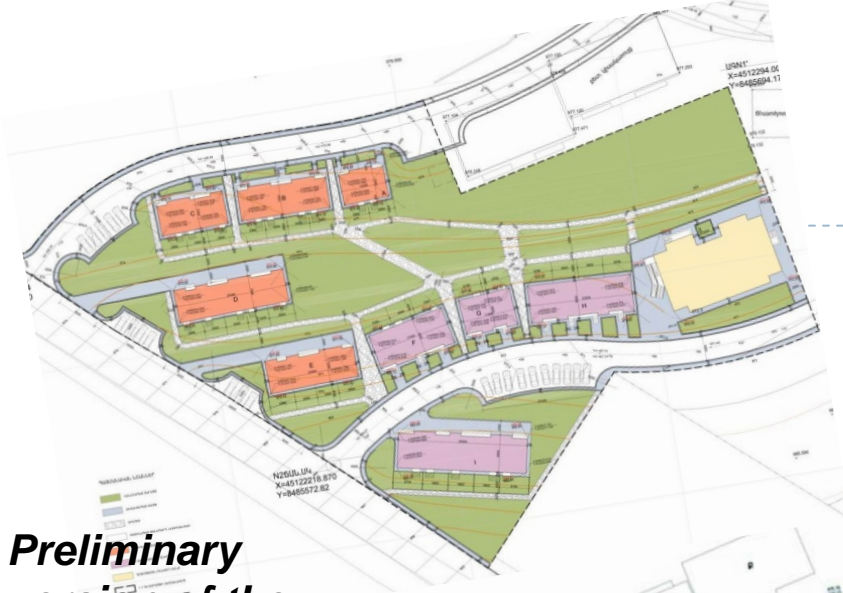
Preliminary version of the project design