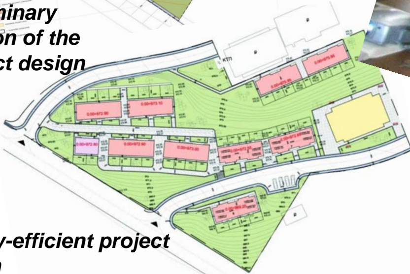
Energy-efficient project design