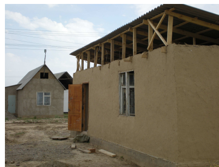
Informal settlement in Bishkek, KR

Regarding land administration, we found that there had been some very significant developments over recent years, including some very successful pilot projects. What is needed now is for these to be implemented nationwide and for further simplification and rationalisation of laws and processes. By Jon Atkey