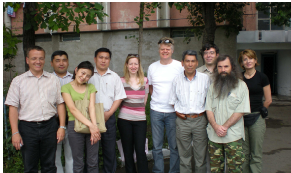
Above: UNECE experts meet with the project managers of a HABITAT for HUMANITY building in Bishkek, Kyrgyzstan.

A group of experts and the Secretariat undertook a mission to Kyrgyzstan to develop the Country Profile on the housing sector in May 2008. The results of their assessment will be shortly available. The group came back with the feeling that the country has great potentials to develop sustainably, in the housing sectors but also in many other areas. Vital Spaces has informally asked them to report about what they see as potentials for the sound development of the housing sector and effective land administration, as well as for sustainable development.