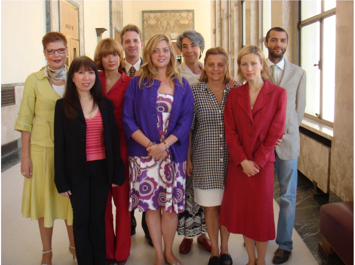
The UNECE Housing and Land Management team