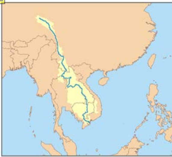
The mighty Mekong river