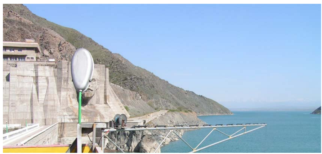
...and on the Talas River...