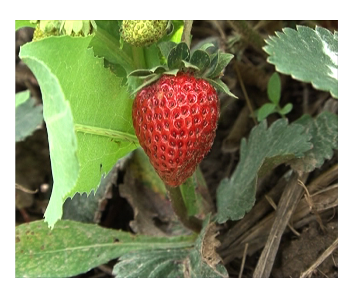
... supply life-giving water to the fields