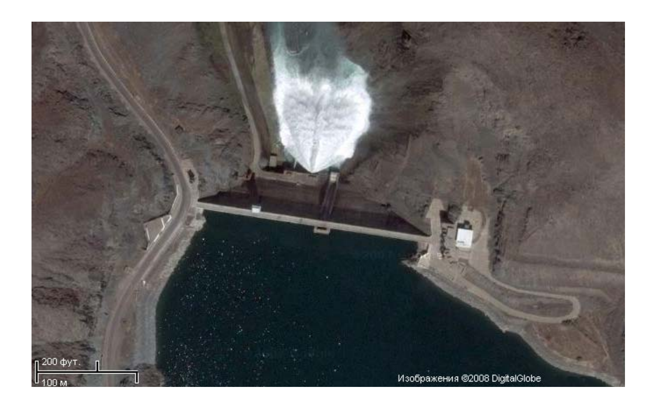
Kirov reservoir on the Talas River: land view and space view