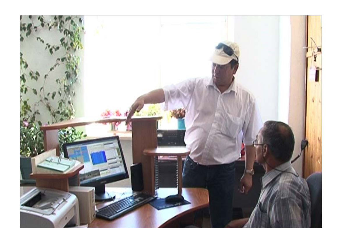
The Western Bolshoi Chu Canal: in the control room ...