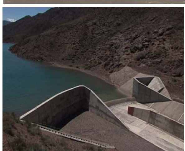
Hydraulic structures on the Chu River...