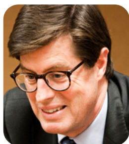
Frederic Romig, Director of the UNECE Sustainable Energy Division

As UNECE member states prepare for the UNFCCC Conference of Parties (COP-15) to be held in Copenhagen this December, the economics of climate change mitigation has emerged as a key issue among national policy makers in many countries. Much of the debate revolves around questions of what can be done to stop global warming, what will it cost and how can we pay for it. Some economists argue that it may not cost the global economy all that much and that the early stages of closing the 'energy efficiency gap' might actually come free. But self-financing climate change mitigation will not be easy. While some reports show that energy efficiency improvements alone could reduce global emissions 30 to 40 per cent, it is just not happening yet. The Financing Energy Efficiency Investments for Climate Change Mitigation project has been designed to address precisely