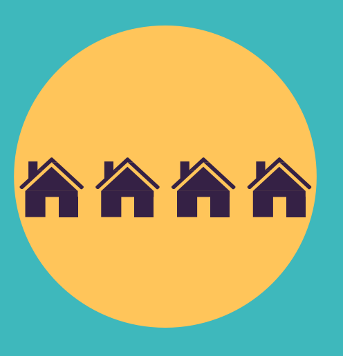
Sustainable Housing And Real Estate Markets