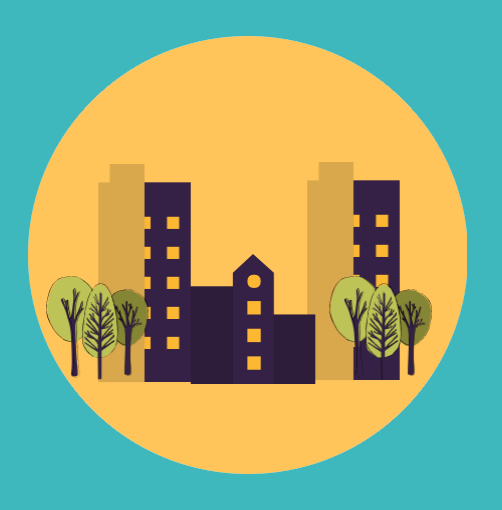
Sustainable Urban Development