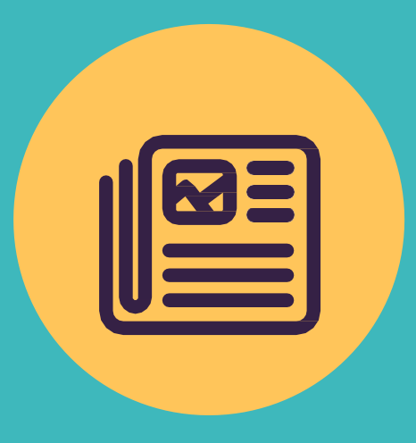
Country Profiles On Housing, Urban Development and Land Management