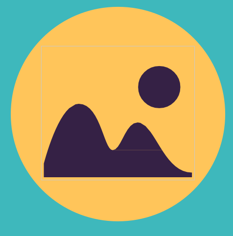
Land Administration And Management