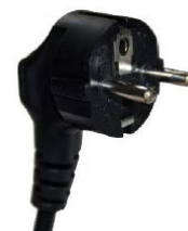
Type F: This will NOT fit

Water. We ask you to consider reducing your contribution to plastic waste by bringing your own refillable water bottle. Geneva tap water consistently rates among the highest-quality tap water in the world.