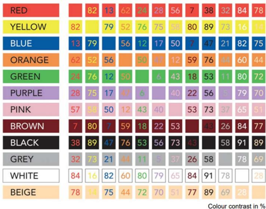
Figure 1 Effect of different colour contrast on legibility