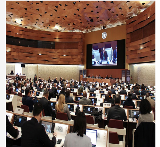
The 85th ITC session