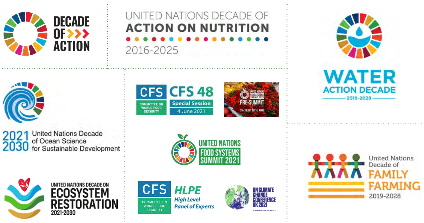
Figure 2. Ongoing global decades

Radical changes in the way food is produced, processed and consumed, especially in the aftermath of the pandemic, are vital to transform food systems, and achieve positive outcomes in relation to food security and nutrition. The changes will be in line with the Secretary-General's call to build back better and to leave no one behind, while at the same time transforming how we manage resources, restore ecosystems, and promote family farming. The regional propositions in the present report address regional barriers, and are influenced by national and local practices and by global initiatives and programmes.