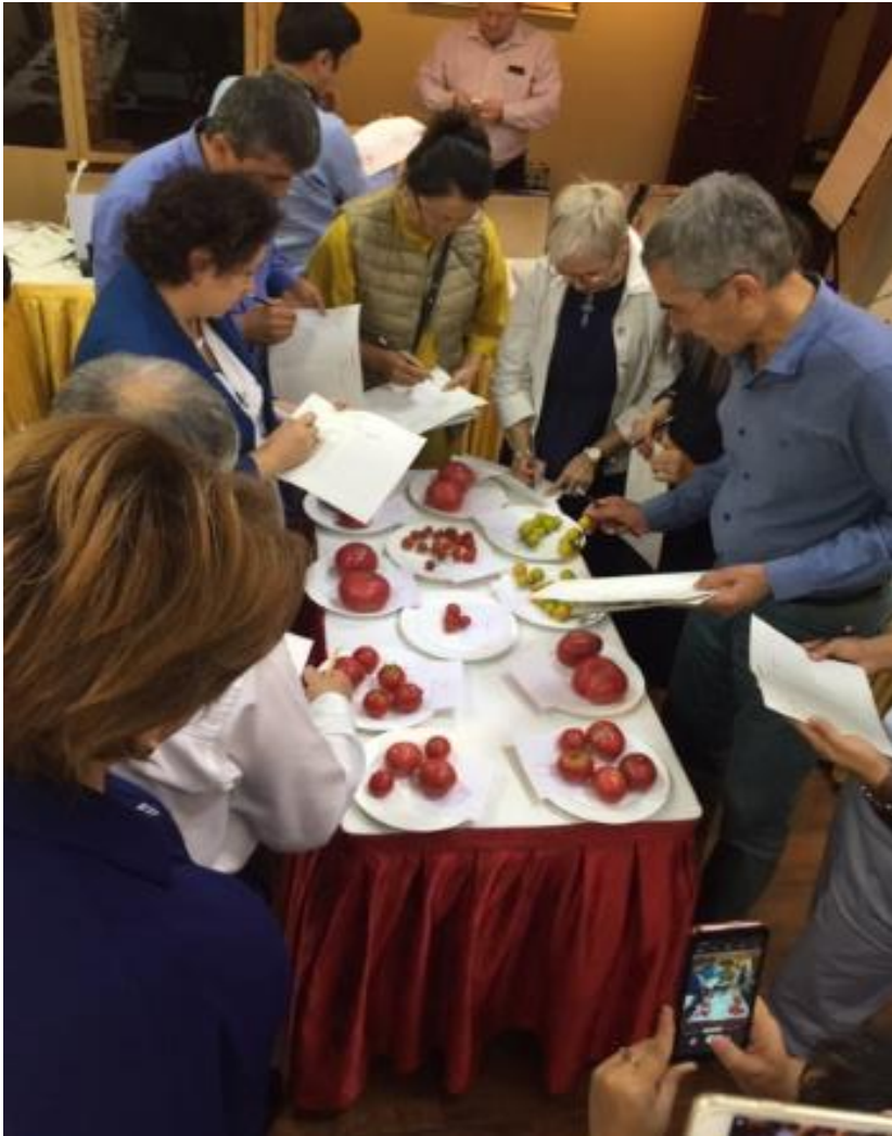
Training and support, UNECE