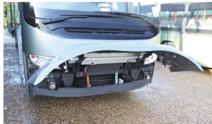
Examples of front protection