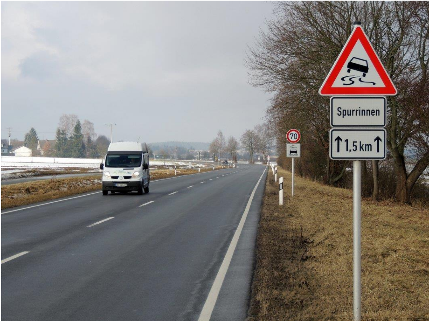
On the state road to Eschenbach. Germany, 2016.