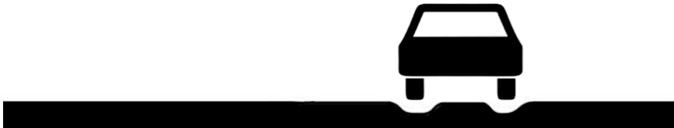
Longitudinal rut or ruts