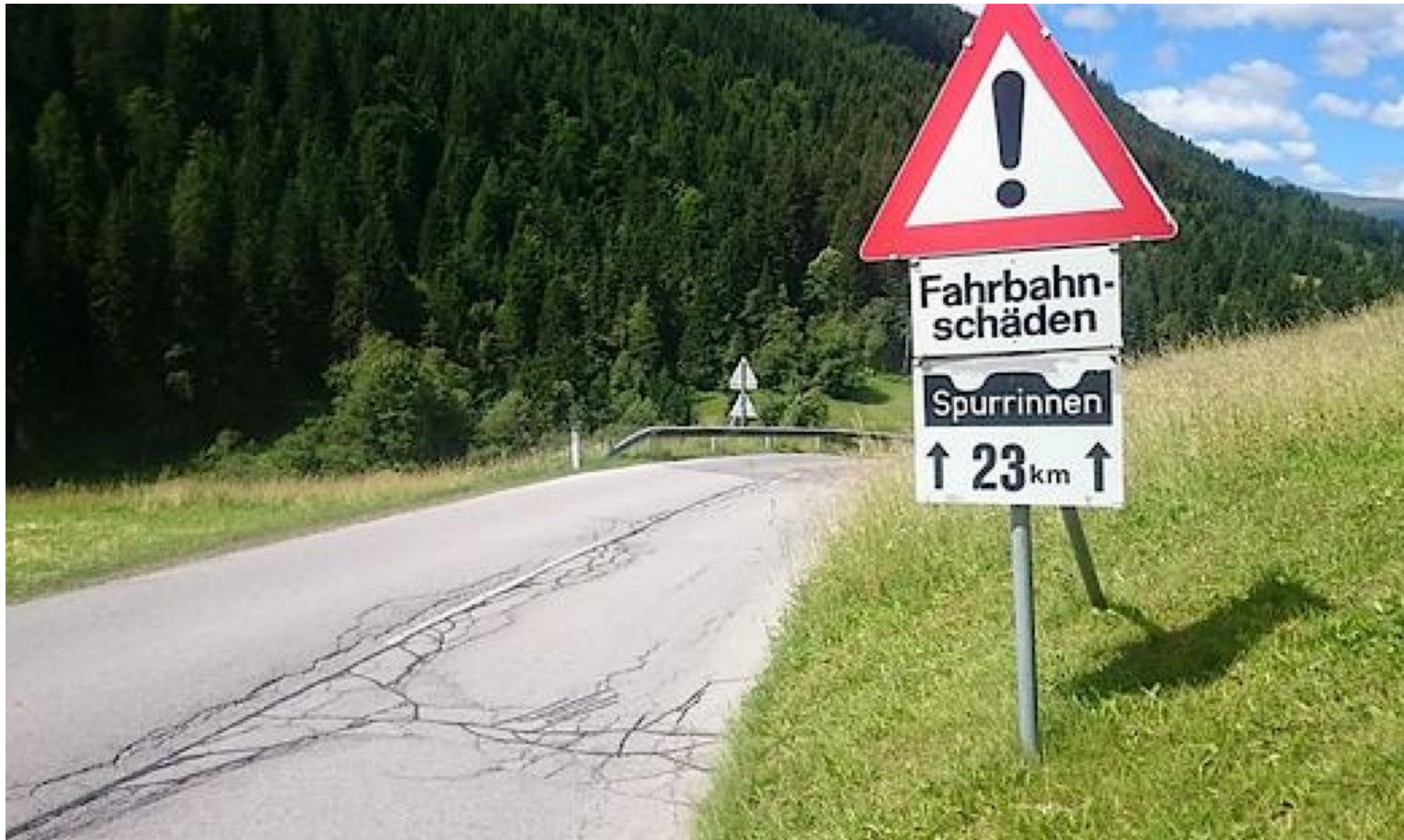
© Hartweger, Kleine Zeitung , B111 Gailtalstrasse. Austria, 2015.