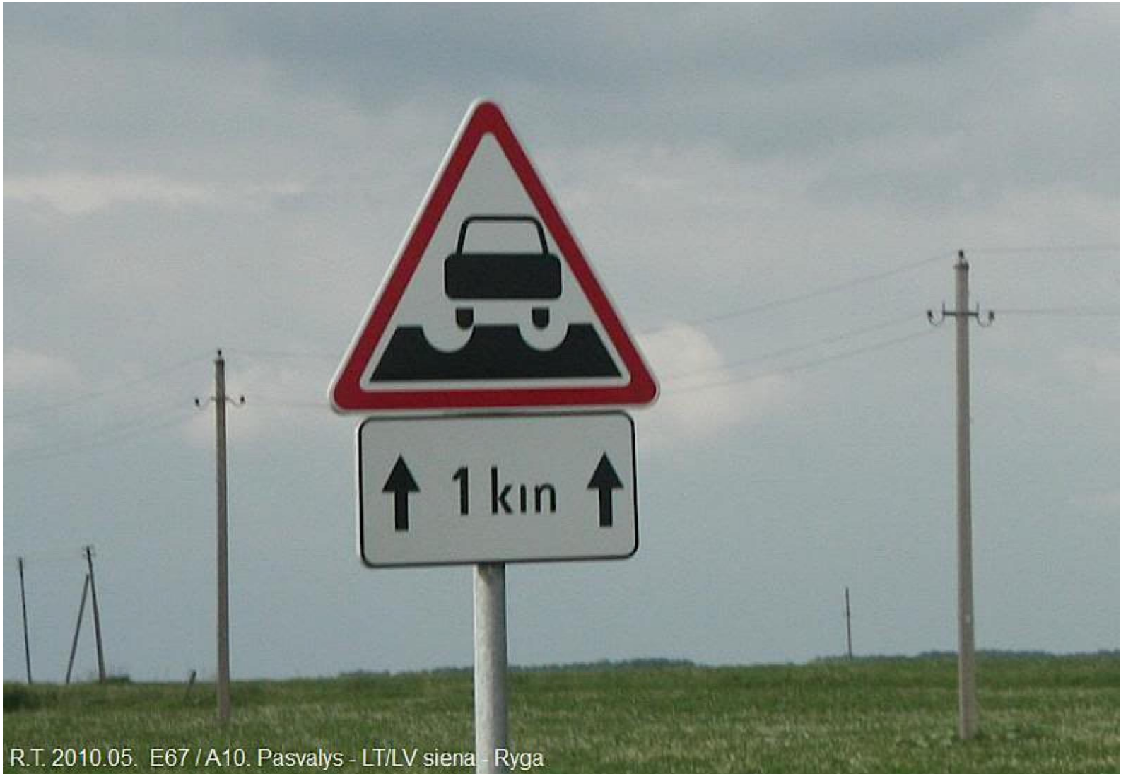
R.T. 2010.05. E67 / A10. Pasvalys - LT/LV siena - Ryga