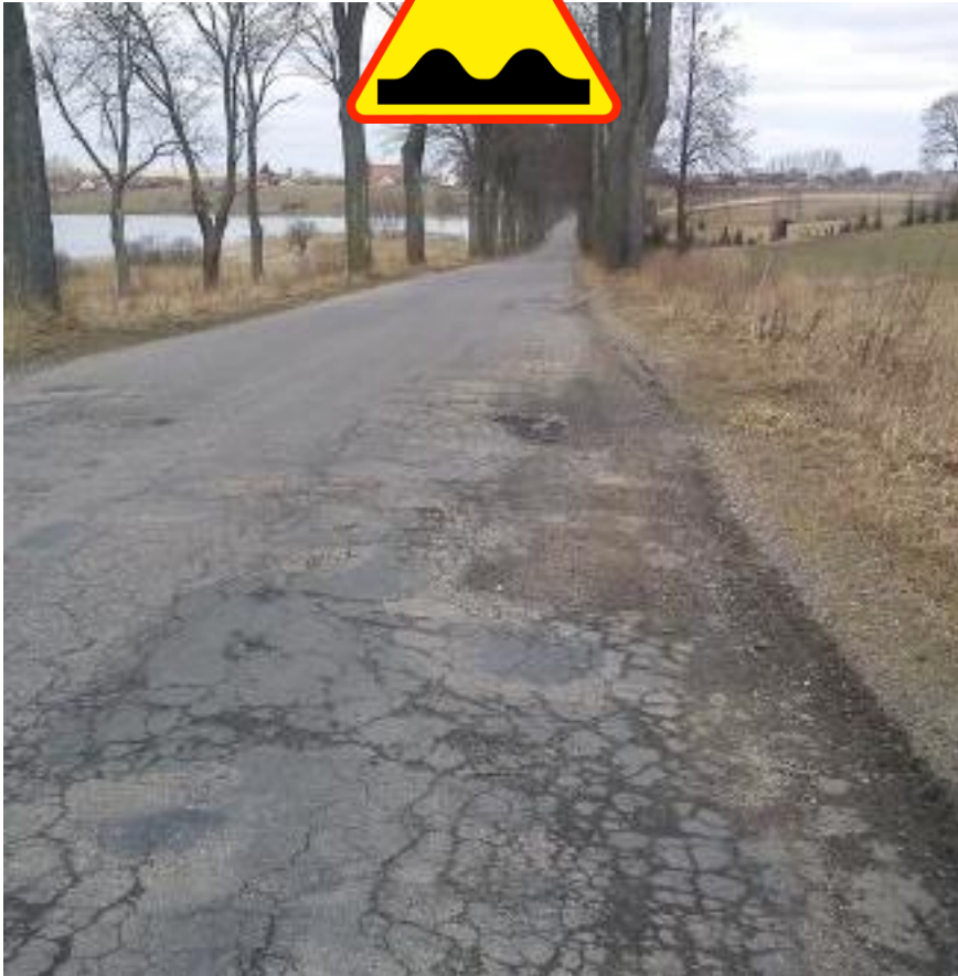
Courtesy of © Olsztyński District. Jezioran, Poland, 2017. Photo cropped.