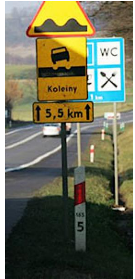
© Znaki drogowe. Poland, 2017. Photo cropped.