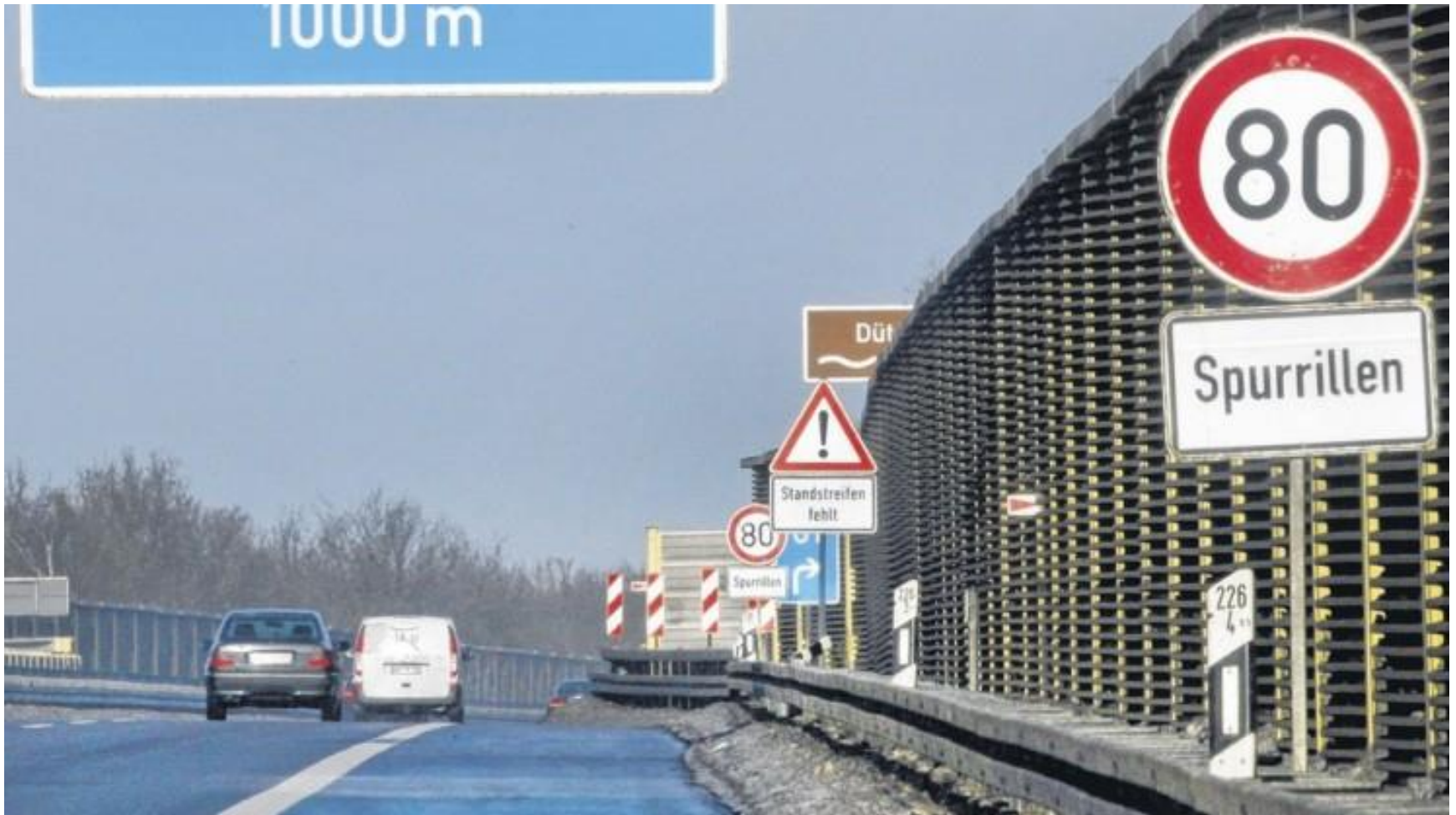
Courtesy of © J. Martens, Neue OZ (Osnabrücker Zeitung) , noz.de. Germany, 2011.