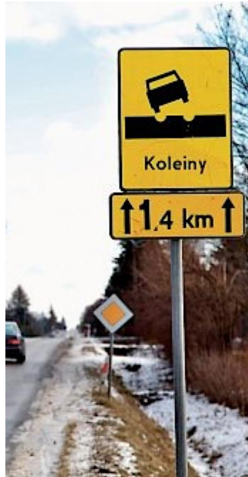
© magazynauto. Poland, 2014. Photo cropped.