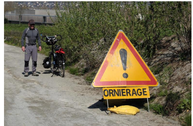
© Anon, Déjà un voyage. Mayenne, France, ~2015.