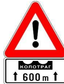
Austria, Bosnia & Herzegovina, Croatia, Czech Republic, Macedonia, Serbia, Slovenia