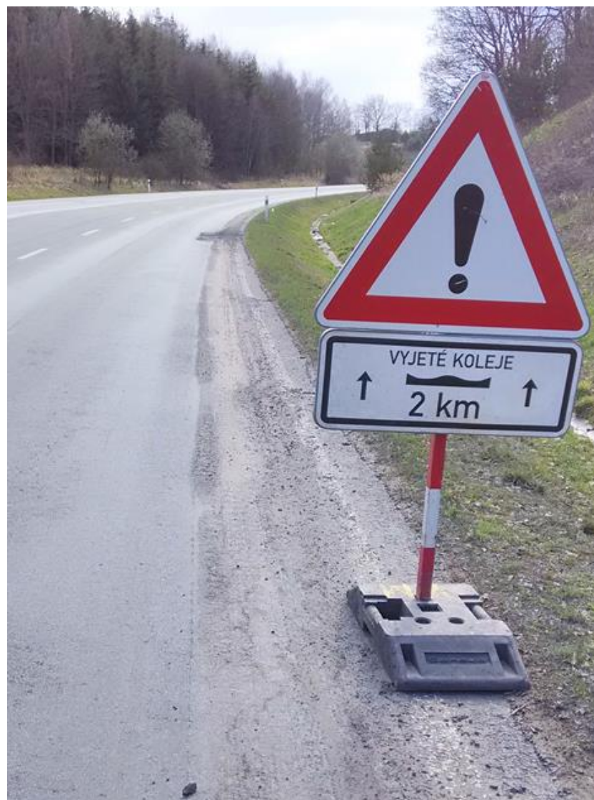
© Noviny VM.cz, Czech Republic, 2016. Photo cropped.