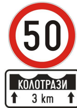
(same 7 as above)