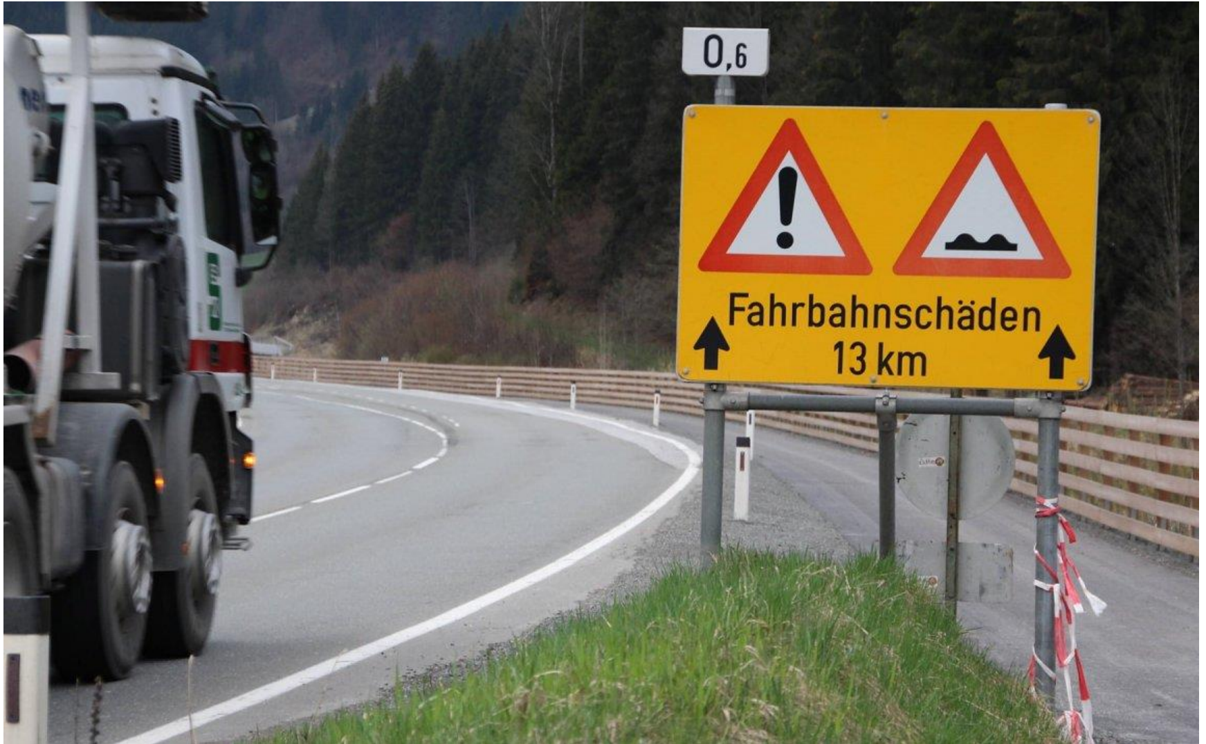
Damaged road. [Warning sign points to kilometers of ruts.] Salzburg, Austria, 2016.