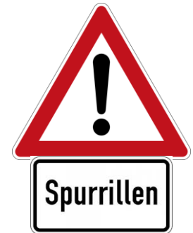
Germany, Austria, Belgium, France, Luxembourg