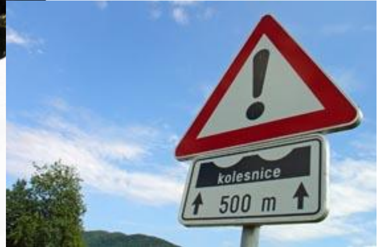
© Cost 354.zag. Slovenia, no year.