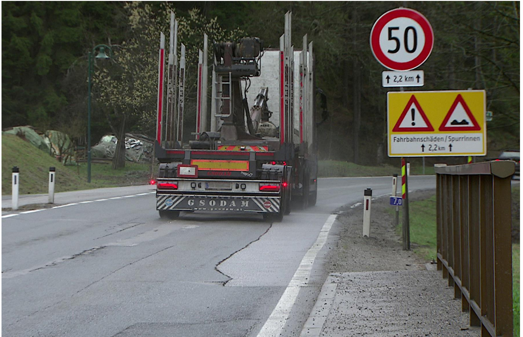
Courtesy of © ORF, Ruts: 50 km / h instead of repair. Annaberg-Lungötz, Austria, 2017. Photo cropped.