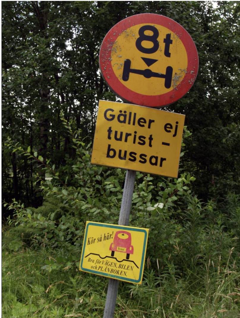
Kloster, Sweden, 2006.