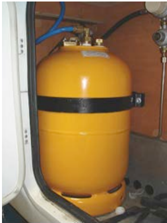
Figure 1: Steel cylinder