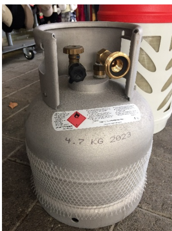
Figure 4: Small aluminium cylinder