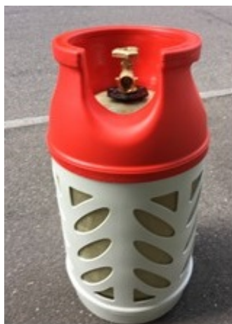
Figure 5: Composite cylinder