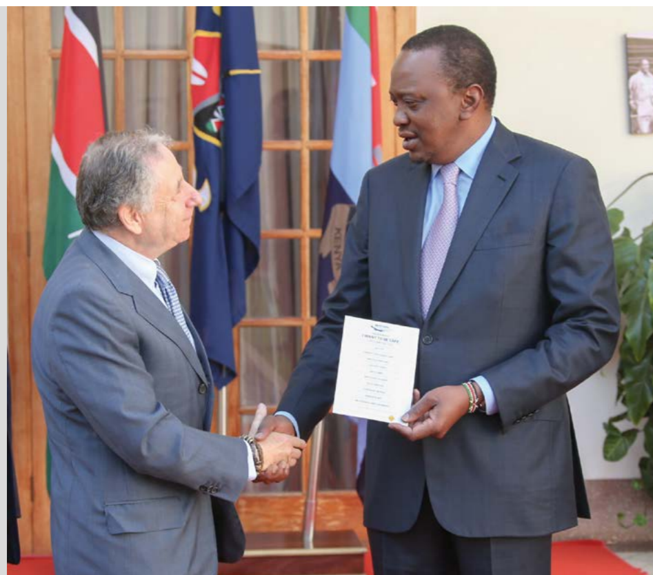
PRESIDENT OF THE REPUBLIC OF KENYA UHURU KENYATTA DISCUSSING ROAD SAFETY WITH THE SPECIAL ENVOY.