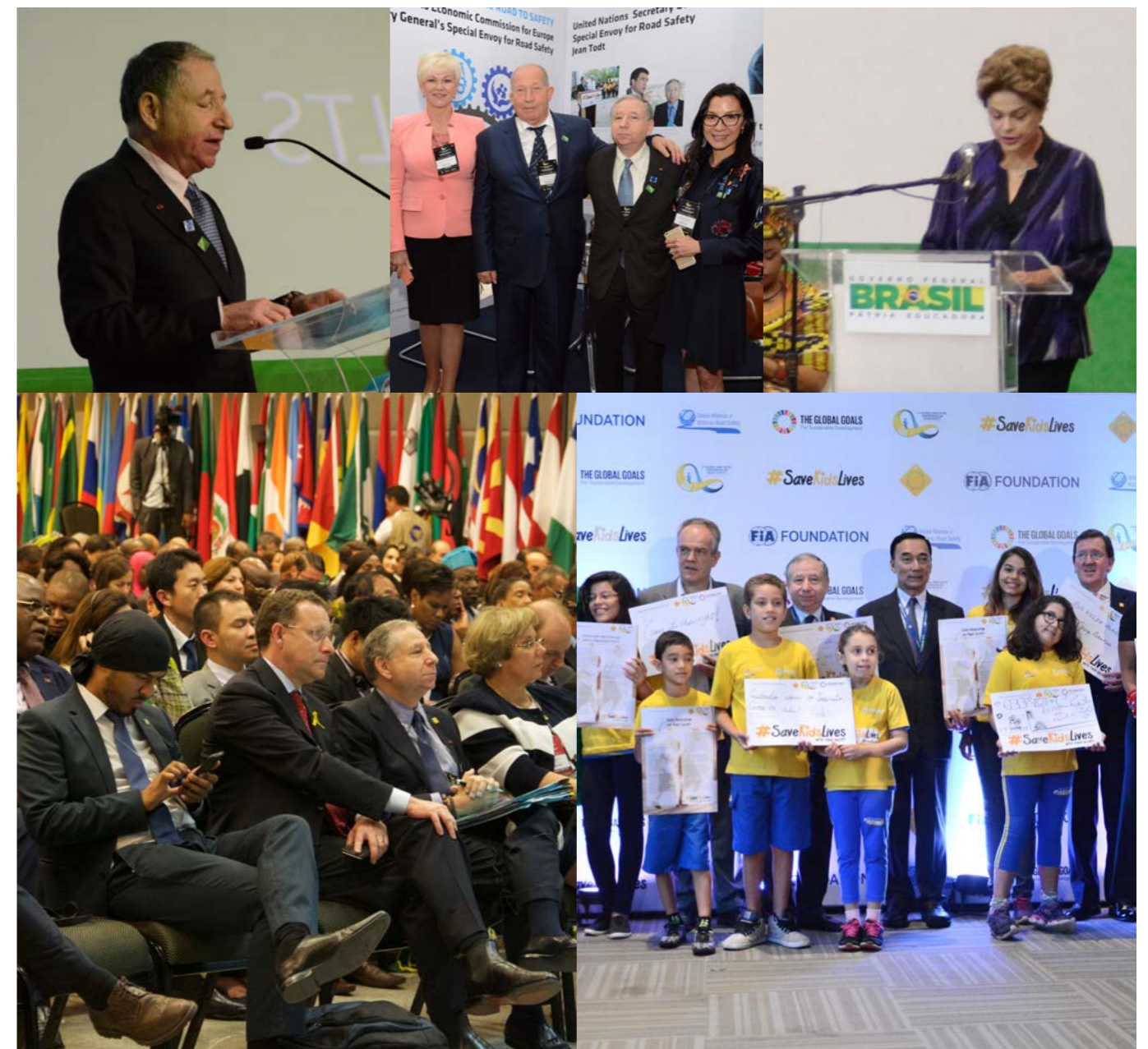
THE 2 ND GLOBAL HIGH-LEVEL CONFERENCE ON ROAD SAFETY WAS HELD IN BRASILIA ON NOVEMBER 18 – 19.

A meeting was held to discuss potential synergies with OECD on Road Safety. Also under discussion was the role of the Special Envoy and the support that could be brought by France in terms of regional and European cooperation.