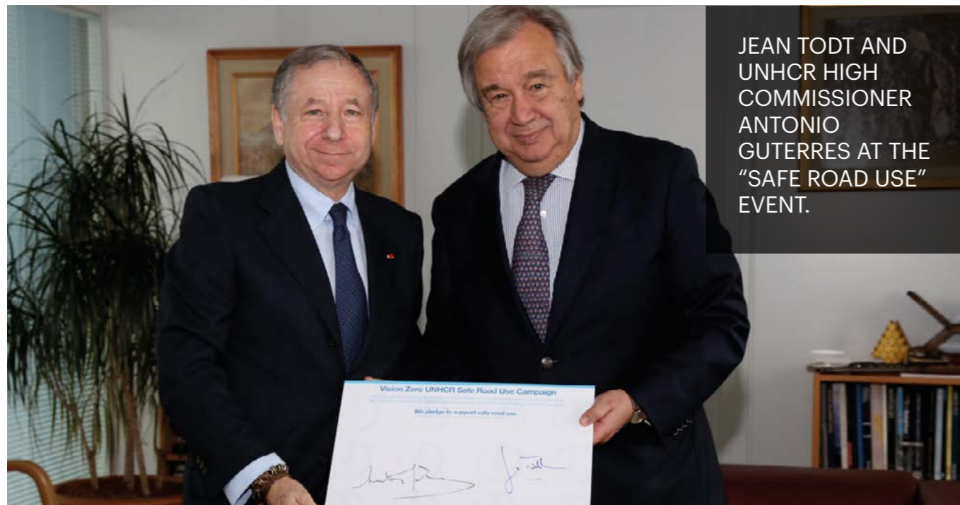
JEAN TODT AND UNHCR HIGH COMMISSIONER ANTONIO GUTERRES AT THE "SAFE ROAD USE" EVENT.

Safe Road Use is a campaign launched by UNHCR in support of the UN Decade of Action for Road Safety that aims to bring the number of road crash casualties involving UNHCR vehicles to zero. This is a crucial matter of safety for UNHCR, as it has the largest fleet of vehicles in the UN system with more than 5,000 vehicles in service in 123 countries. Last year, 15 staff lost their lives due to road crashes involving the organization's vehicles. By setting up a "Vision Zero Plan", UNHCR acknowledged that road crashes are preventable and that the organization will work towards implementing well-known and efficient solutions.