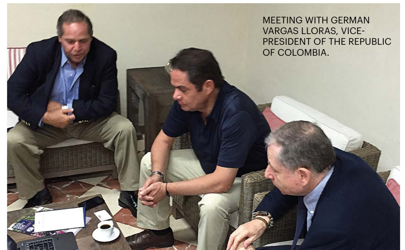
MEETING WITH GERMAN VARGAS LLORAS, VICE-PRESIDENT OF THE REPUBLIC OF COLOMBIA.

A strategy meeting with UNECE staff was also held. Both meetings were attended by Christian Friis Bach, Executive Secretary and Under Secretary-General for UNECE.