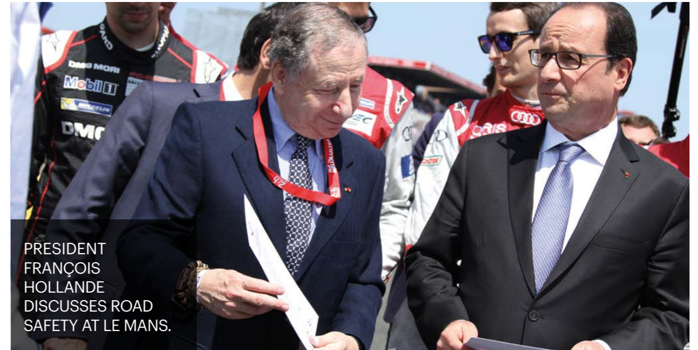
PRESIDENT FRANÇOIS HOLLANDE DISCUSSES ROAD SAFETY AT LE MANS.