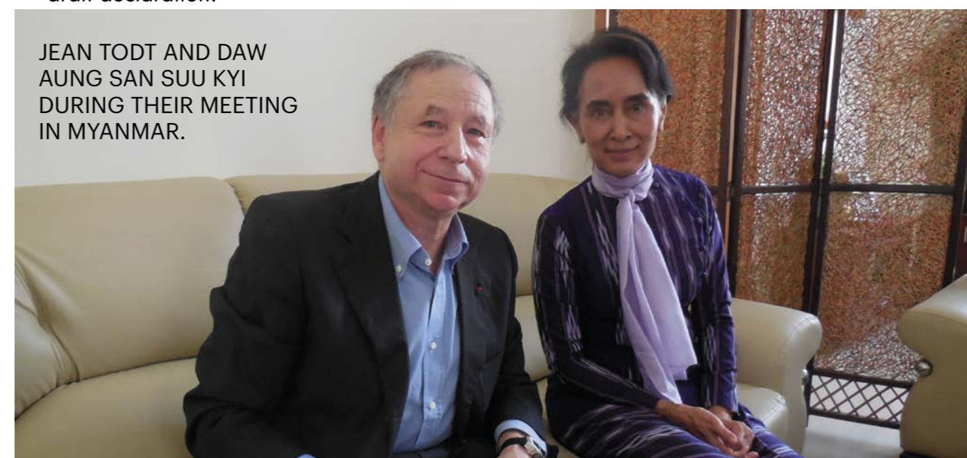
JEAN TODT AND DAW AUNG SAN SUU KYI DURING THEIR MEETING IN MYANMAR.

In his meeting with representatives from the Mission of Brazil, the Special Envoy introduced his role and mission. Discussions were on the programme of the Brasilia Conference, as well as the draft declaration.