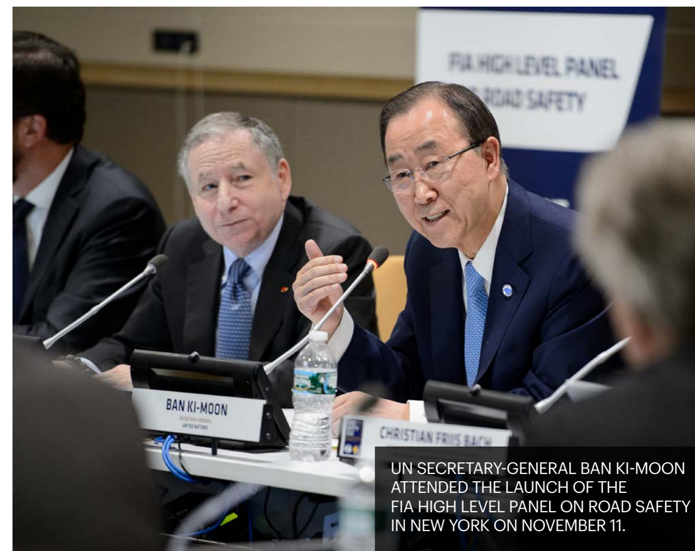
UN SECRETARY-GENERAL BAN KI-MOON ATTENDED THE LAUNCH OF THE FIA HIGH LEVEL PANEL ON ROAD SAFETY IN NEW YORK ON NOVEMBER 11.

The Special Envoy attended a moment of silence which was observed during the Brazilian Formula 1 Grand Prix in memory of road traffic victims and the 20th World Day of Remembrance of road traffic victims – an initiative created by the European Federation of Road Traffic Victims (FEVR) and adopted by the United Nations in 2005.