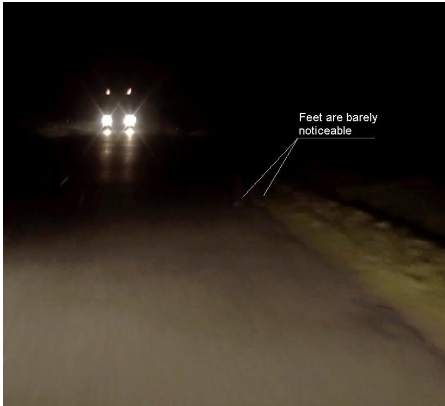
Fot. 1. Real situation. By using typical passing beam pedestrians wearing dark clothes can be seen only at very close distance.

When vehicles pass in the opposing direction, drivers are exposed to headlamp glare. Visibility is impaired. Also, the practical road illumination distance of passing beams adjusted according requirements of Reg. 48 can be limited to 20-50 m. It is illustrated on Fot.1.