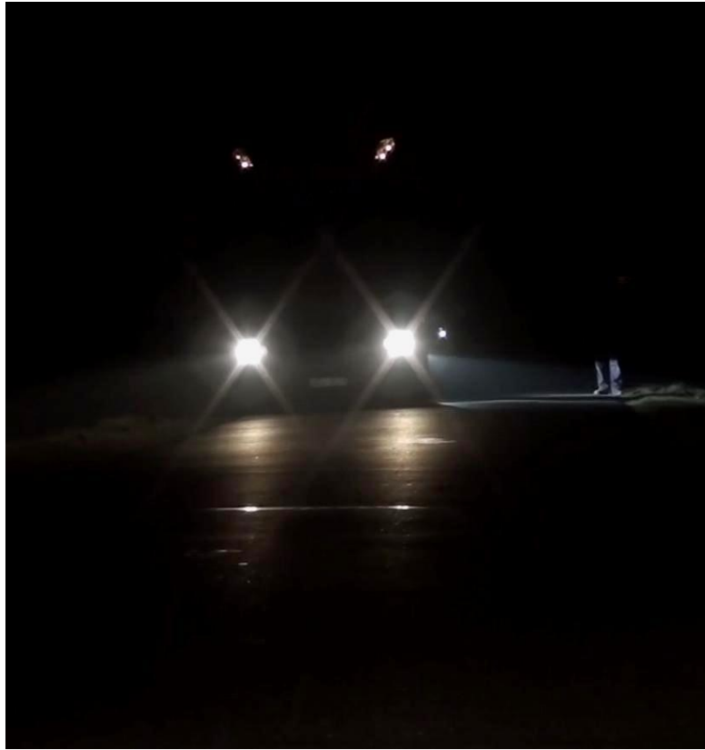
Fot. 2. Side illuminating lamp perfectly illuminates pedestrian's leg even in black trousers.

Many following vehicles in typical situation of dense traffic equipped with such lights can provide additional illumination at a much greater distance to oncoming drivers. Because these lights are directed down and to the side they not hamper other road users. These are similar to cornering lights but are much less visible to other road users.