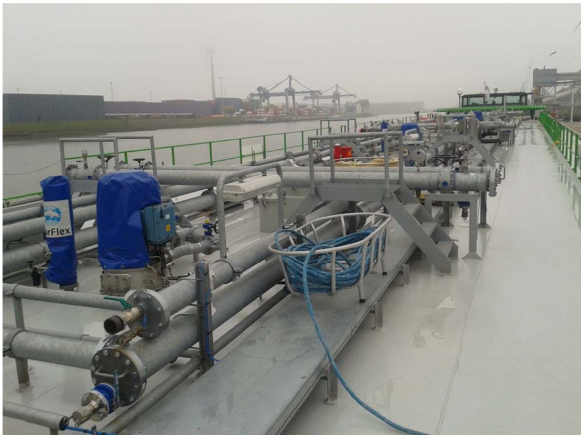
Overview of the tanker deck looking forward

The 'Greenstream' is in service since April 2013 and the 'Green Rhine' since September 2013. The barge is classed by Lloyd's Register, and the statutory certificates are issued by Lloyd's Register on behalf of the Netherlands Shipping Inspectorate.