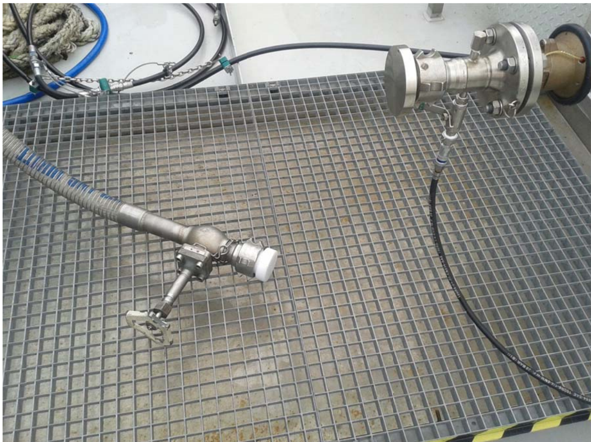
Bunker connection prior to the bunkering, with the hose (left) coming from the delivery truck

The variety of bunkering checklists demanded by the different authorities involved at the various bunkering locations were causing difficulties for the operator of the vessel. Furthermore being a tanker the restrictions that were raised in case the tanker was sailing with a blue cone makes it to a logistic challenge to plan for the bunker moment.