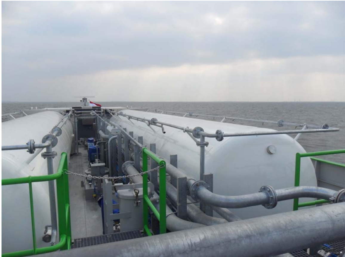
Looking aft over the two LNG storage tanks

Only during the very first bunkering of the 'Greenstream' at the shipyard a minor leakage on a flanged connection has occurred due to cooling down and shrinking of the material. Leakage has been solved immediately by tightening all the bolts of the flanged connections. Since delivery no leakages have been discovered. Not in the liquefied gas system and not in the natural gas part of the system.