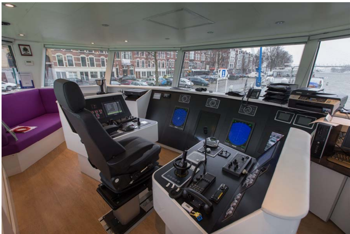
View in the wheelhouse

Emission data has been collected at the 'Greenstream' on September 17 th 2014. The data are attached in a table as Annex 2. These data are nearly the same as on the test bank before the engines were installed on board. The data aren't translated to values of gr/kWhr as this needs much more testing. However, it can be concluded that the emission values are as may be expected from these gas engines, and are below the CCNR II values of diesel engines.