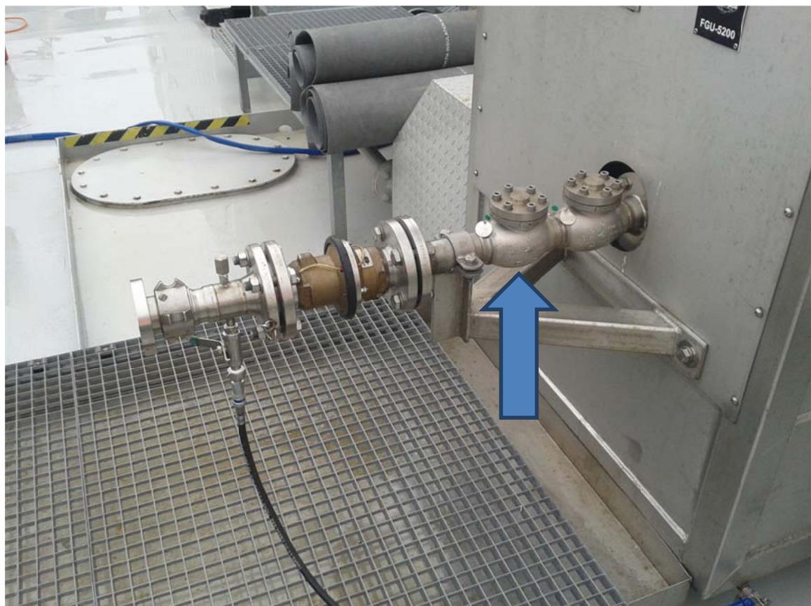
Bunkering connection with (from left to right) the connection flange, Nitrogen connection, dry break away coupling and two non-return valves. The additional non-return valve is pointed at with the blue arrow

On demand of the charter party additional non return valves have been installed at the bunker line at PS and SB. This has been done shortly after the first vessel has entered into service. Although this modification is not necessary according class rules, Lloyd's Register has accepted it.