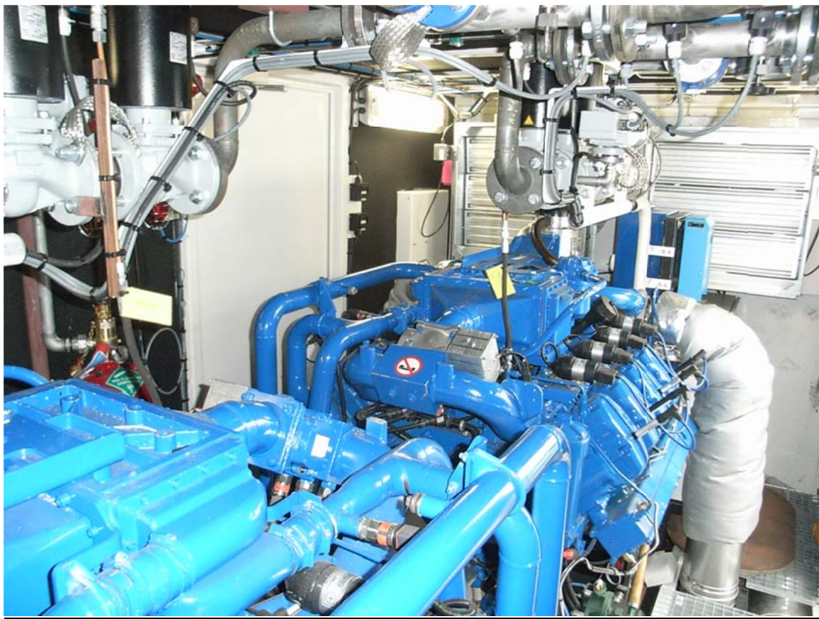
Engine room with the two Scania gas engines

During the first months after commissioning the propulsion system of the 'Greenstream' has experienced some unstable behaviour. This was not related to the hardware or safety of the natural gas system, but failures were caused by the dynamical interaction between the engines and the common DC-bus. Measures to improve this behaviour have been implemented after thorough investigations of the problem, and it has been solved. Since then the vessel sails without technical issues.