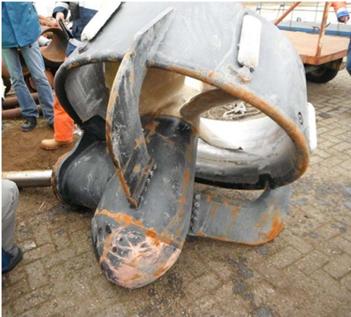
Damaged thruster after recovery

At the first operational sailing voyage of the 'Greenstream' a grounding has occurred resulting in the loss of one of the thrusters. A new thruster has been fitted immediately and the vessel was able to sail again within a few days. The lost thruster has been examined, but no deficiencies were found in the construction. The incident wasn't related to the LNG system at all, and it can be described as 'bad luck'.