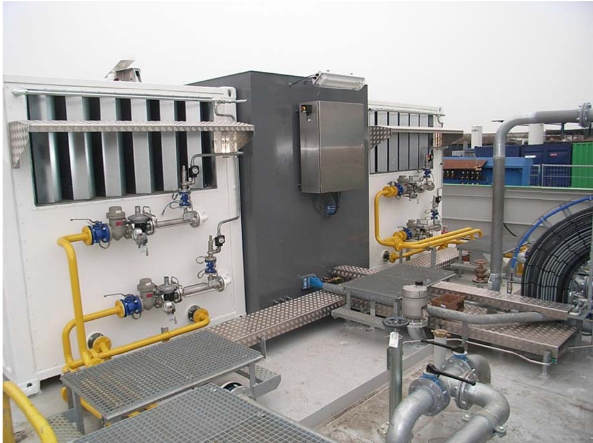
Front side of the engine rooms with the gas valve units

The working pressure of the tanks is always between 4.5 and 5 bar. The pressure relieve valves are set at 8 bar. This relieve valves have never been opened. In case of a quite large waiting time at a terminal with pressure build up above 5 bar, the pressure was reduced by running an engine on that side. The automatic pressure build up system has worked perfectly, and no gas has ever escaped.