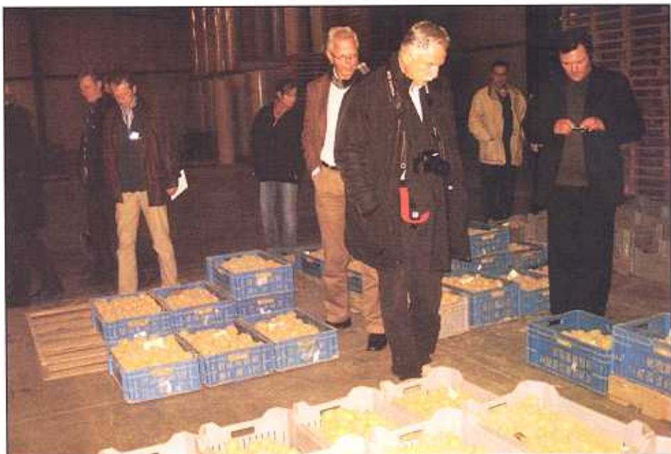
Visiting the results of variety trials of Binst.

The Extended Bureau of the Specialized Section on Standardization of Seed Potatoes of the United Nations Economic Commission of Europe (UNECE) held its meeting on 19-21 October 2009 in Belgium and Luxembourg. Representatives of the following countries attended the meeting: Austria, Belgium, Canada, Czech Republic, Denmark, France, Germany, Italy, Lebanon, Luxembourg, Netherlands, Russian Federation, United Kingdom of Great Britain and Northern Ireland and United States of America. The travel of the seed certification official from the US is funded by the US Potato Board on a recommendation from the Seed Certification Sub-Committee of the National Potato Council.