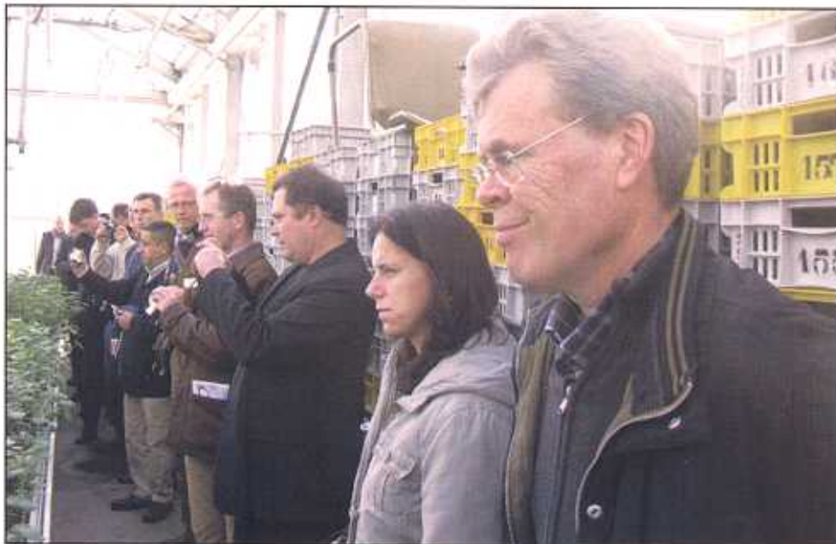
Delegates in Libramont, (right to left) Denmark, Czech Republic, Russian Federation, Austria, Netherlands, Lebanon, Canada, Switzerland, and Belgium.

Tuber Moth -The discussion about the approach to tuber moth damage in a lot resulted in the agreement that countries have zero tolerance for living tuber moth larvae for imported seed. Since internal damage is not sufficiently defined in the standard, Belgium, France, Germany, Netherlands and the United States are to propose defining internal defects in the standard. Internal defects include internal tuber moth damage rust spot and spraing, blue or black spot bruise, and glassiness.