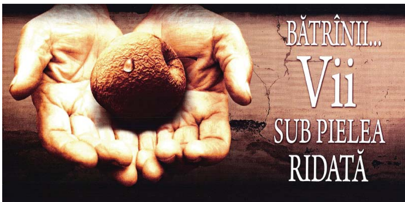
Older people... alive under wrinkled skin Nataly Kanonik (©) - Andrey Rotary (design)

Ageing is clearly a central topic on the Moldovan policy agenda. The creation of the National Commission on Population and Development, the preparation of the National strategic programme on demographic security for 2011-2025, and the inclusion of ageing-related themes in other policy documents makes this clear. The continued willingness of United Nations resident agencies to include references to the needs of older persons in their ongoing strategic planning backs up this impression. The multiplicity of laws and Government decisions pertaining to social protection, pensions and health confirm that the Government is committed to reducing poverty and vulnerability amongst older persons. The issue, then, is to ensure that ageing is viewed holistically, in terms that recognize the challenges faced by older persons themselves and the contributions they could make to society if it is set up to welcome such contributions, as well as in a way that accepts that ageing is an ongoing process throughout the life course, rather than an either/or state triggered by a person reaching a particular age or life transition. This means that the Moldovan policy agenda must be broadened to extend beyond what is often principally a consideration of age structure, demographic rates and economic imbalances. It is hoped that this Road Map, based on the commitments of MIPAA/RIS, will bring such issues into the foreground.