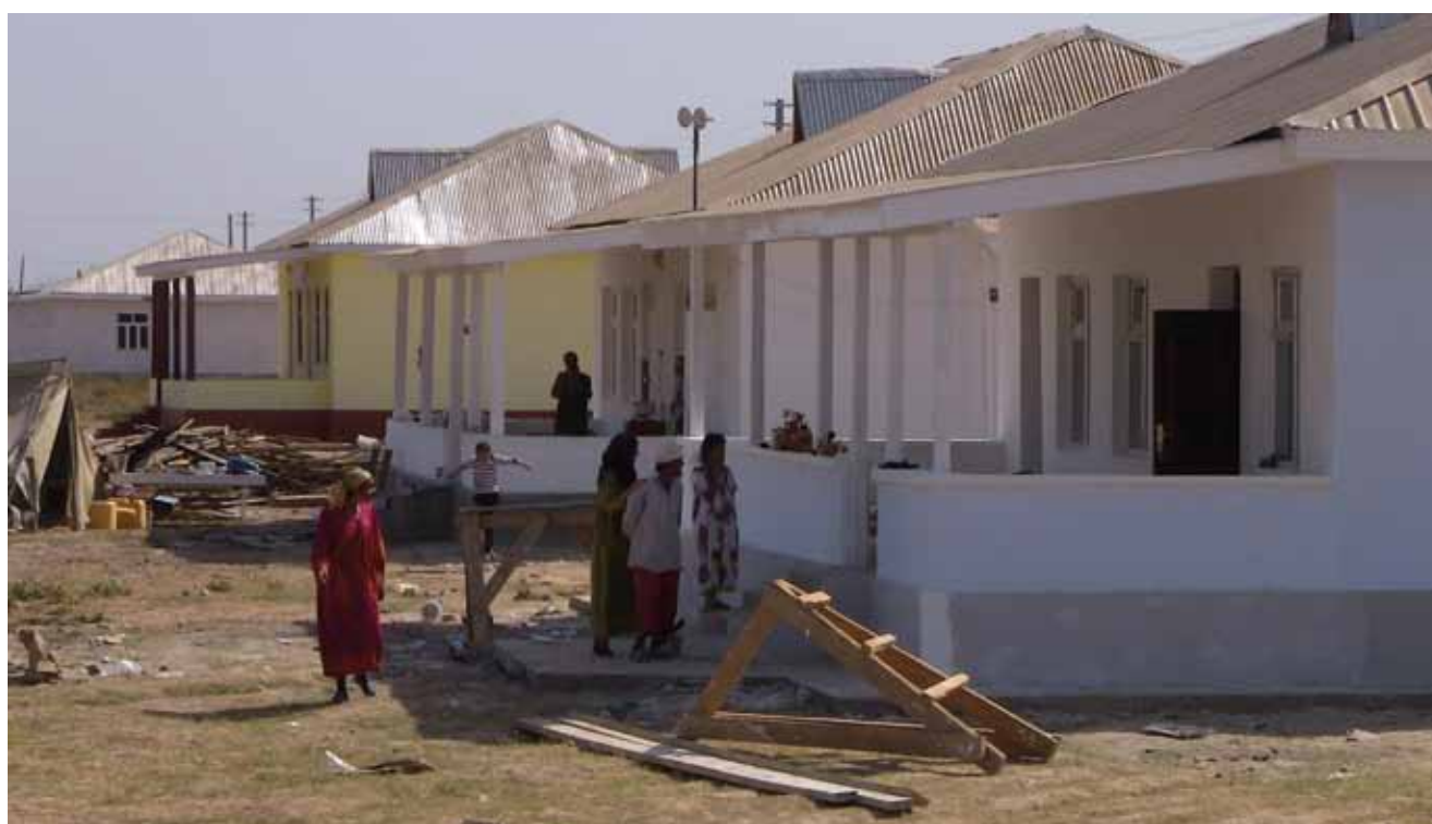
Picture 2. Houses constructed by the Government for the victims of natural disasters.

The substantial progress made in achieving macroeconomic and financial stabilization was not