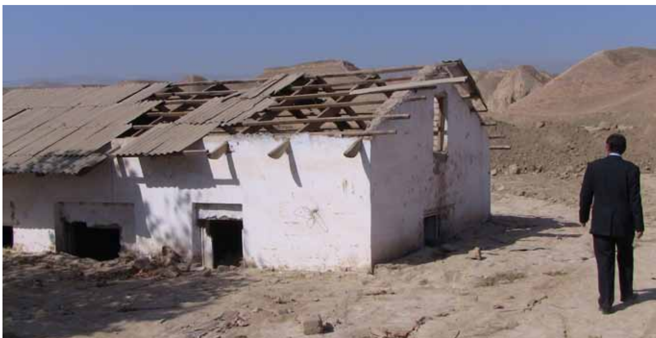
Picture 1. Family house destroyed by a landslide, Vanj district

The legislative body is made up of a two-chambered Majlisi Oli (Parliament) which