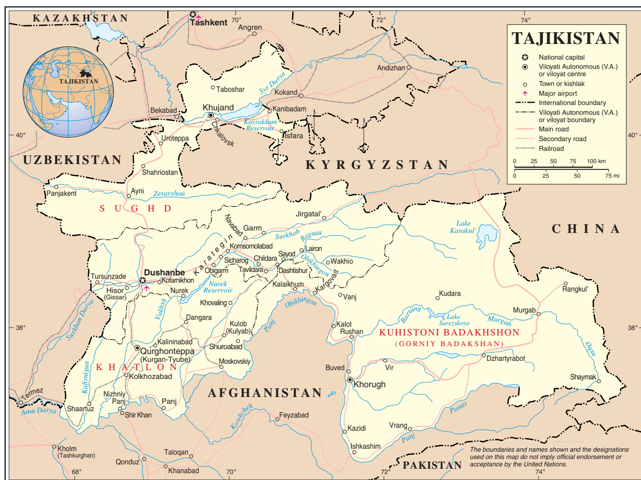
Figure 1. Map of Tajikistan

Map No. 3765 Rev. 11 UNITED NATIONS October 2009