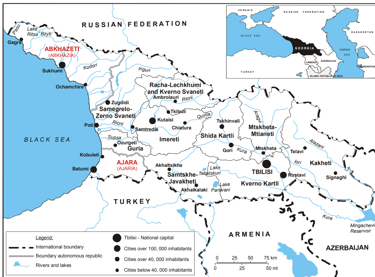
Figure 1.1. Map of Georgia

The boundaries and names shown on this map do not imply official endorsement or acceptance by the United Nations.