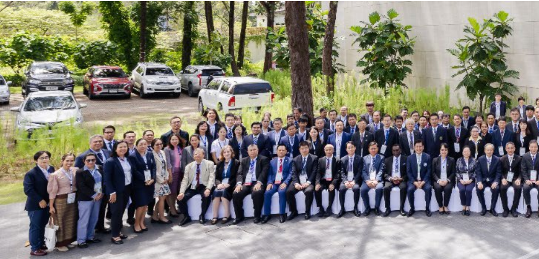
59 th CCOP Annual Session & 81 st Steering Committee Meeting, Khao Lak, Phang Nga, Thailand