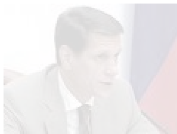
Deputy Prime Minister Alexander Zhukov

issues of wider-European cooperation and integration, and for tackling more technical issues in a number of important sectoral areas. One of the other main topics discussed with Foreign Minister Lavrov was the 2007 session of the Commission, which would coincide with the 60th anniversary of the UNECE.