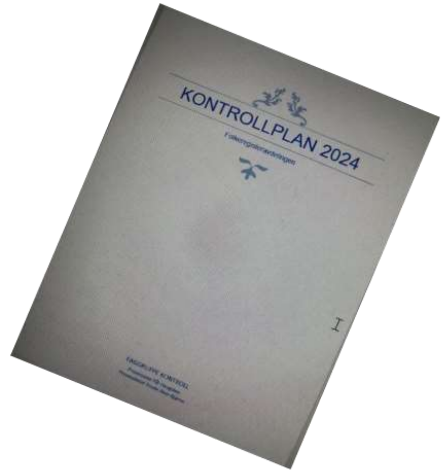
Control Plan 2024, Department of NPR, Control Unit