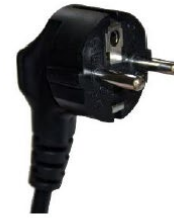
Type F: This will NOT fit

Water. We ask you to consider reducing your contribution to plastic waste by bringing your own refillable water bottle. Geneva tap water consistently rates among the highest-quality tap water in the world.