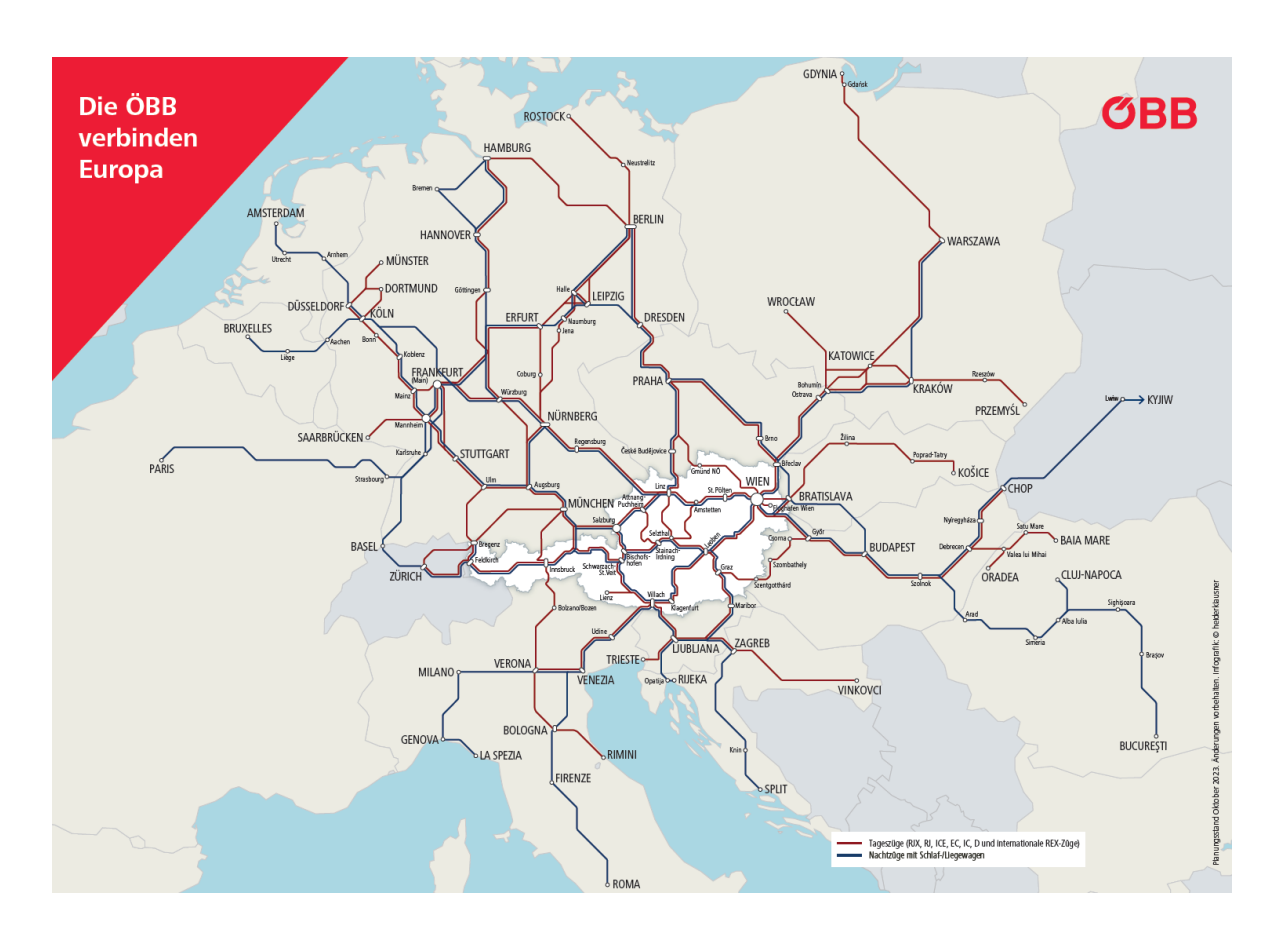
Figure 1: International day and night train lines operated by ÖBB and its partners

Austria is well connected to many other European countries by day trains. For instance, from Vienna day trains run to other major European cities as follows: