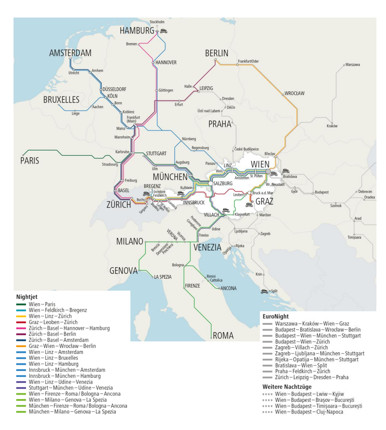
Figure 3: Night train network of ÖBB and its partner railway untertakings

Austria is well connected to many other European countries also by night trains (see Figure 3). The Austrian Federal Railways (ÖBB), in particular, operate a comprehensive network of night trains labelled as "Nightjet". Furthermore, partner railway undertakings of ÖBB, mainly other federal railways, operate night train lines labelled as "EuroNight".