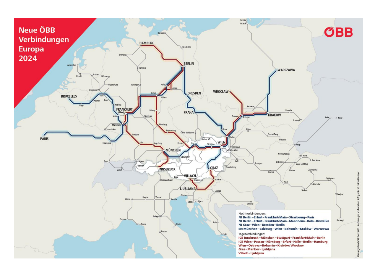
Figure 4: International day and night train lines starting in 2024

Both the Nightjet network and the EuroNight network have been extended gradually in recent years. In 2024, a new Nightjet line between Berlin and Paris/Brussels, a new Nightjet line between Berlin and Vienna/Graz and a new EuroNight line between Munich and Warszawa will go into operation (see Figure 4).